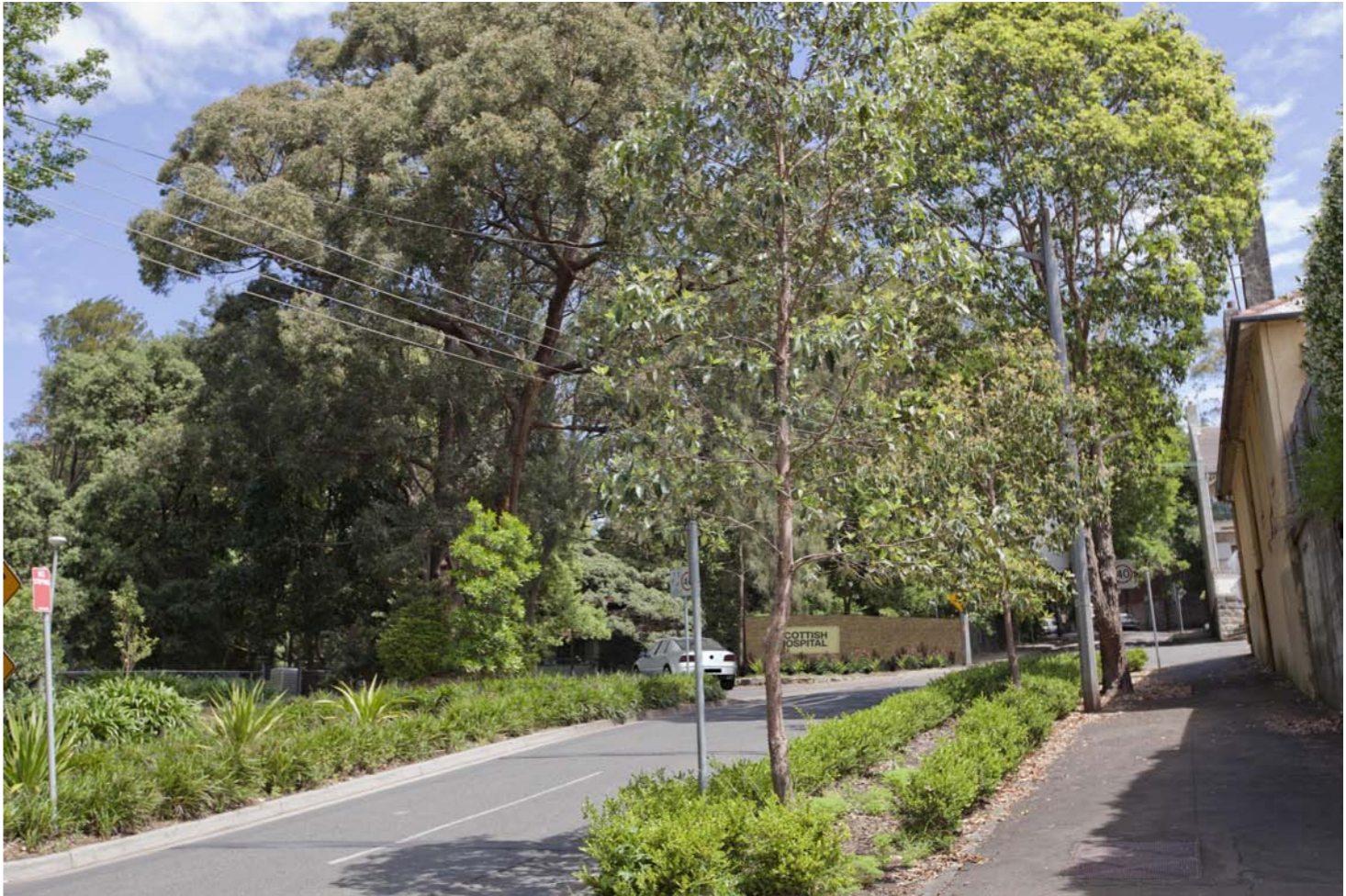
View 9 - Nield Ave & Brown St