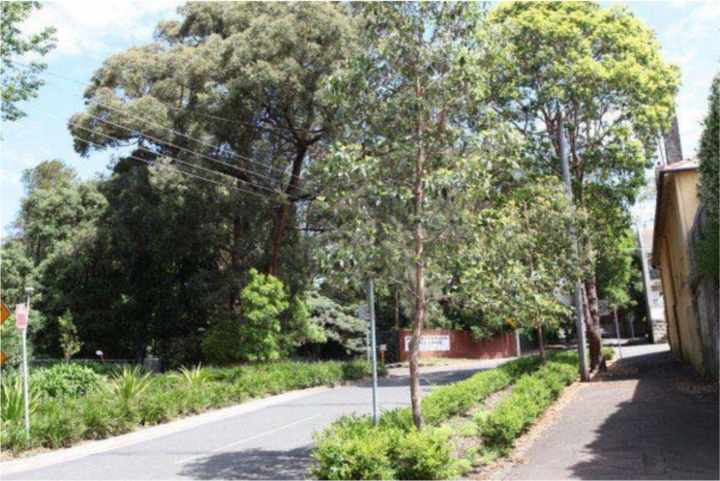
View 9 - Nield Ave & Brown St