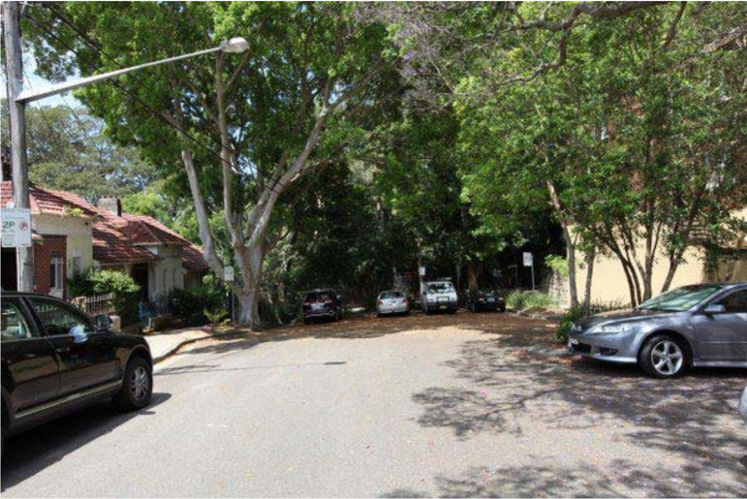
Existing View 10 - Glenview St & Brown St