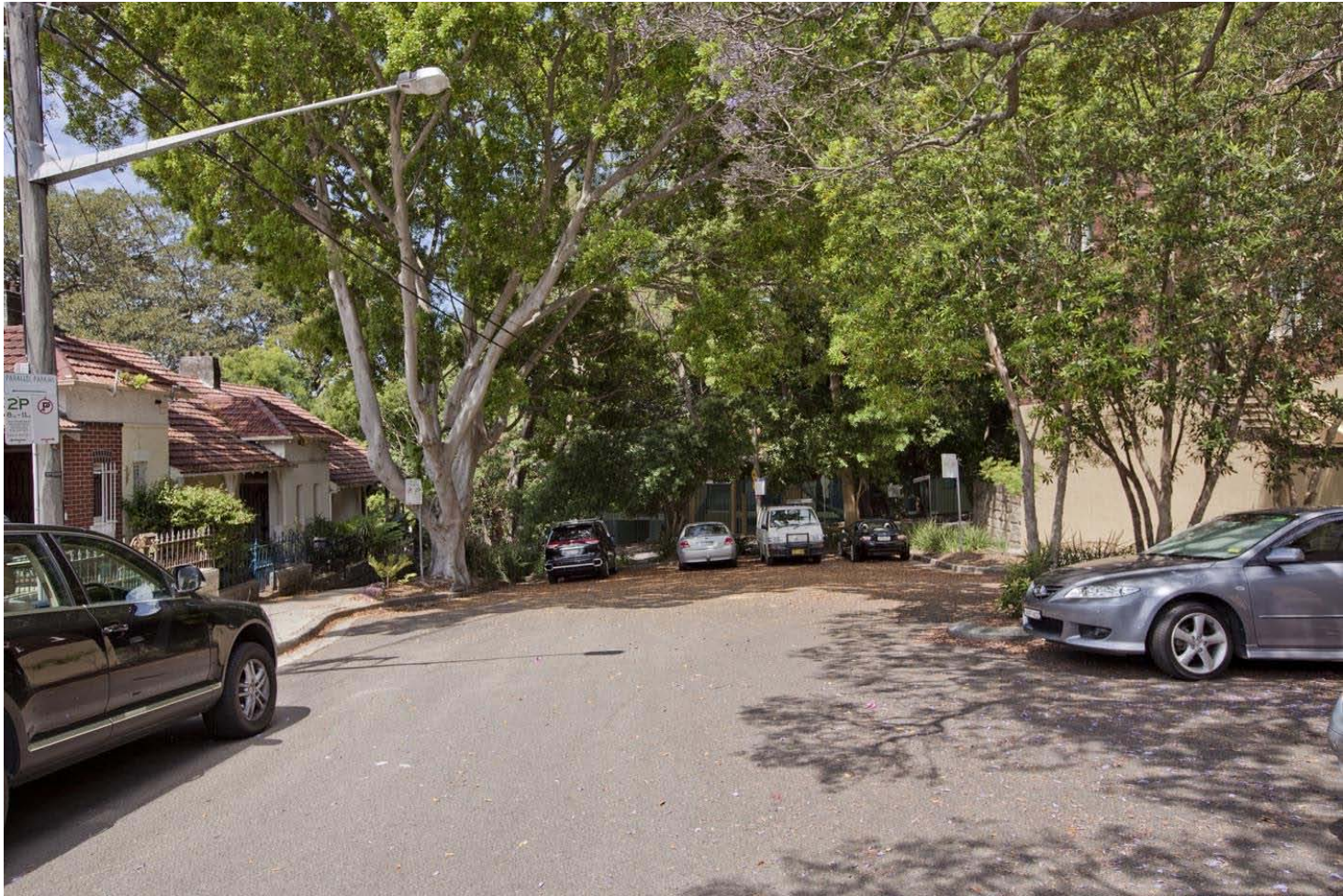
Proposed View 10 - Glenview St & Brown St