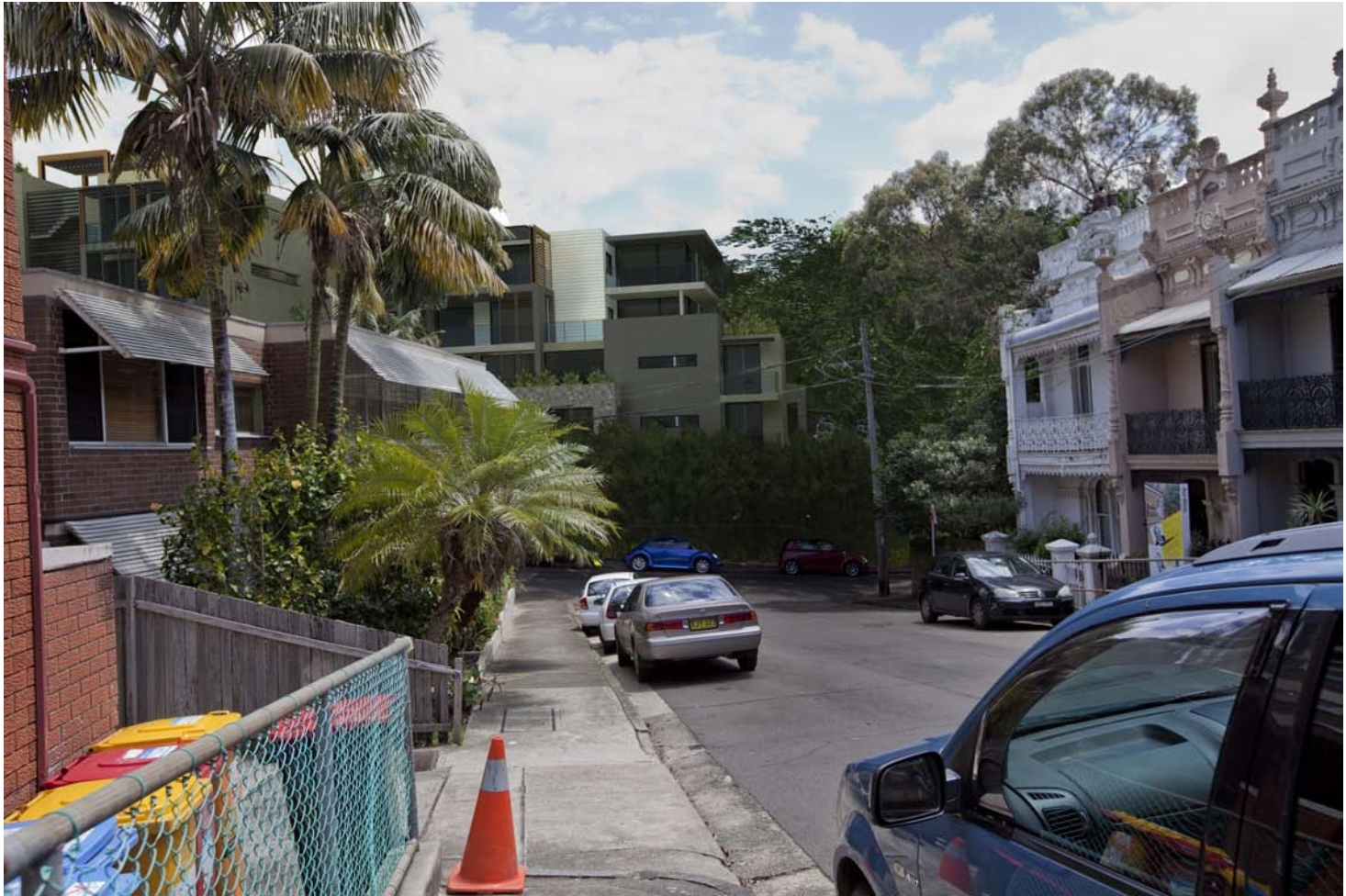
Proposed View 5 - Glenn St