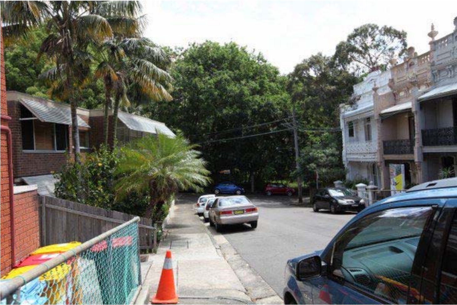
Existing View 5 - Glenn St