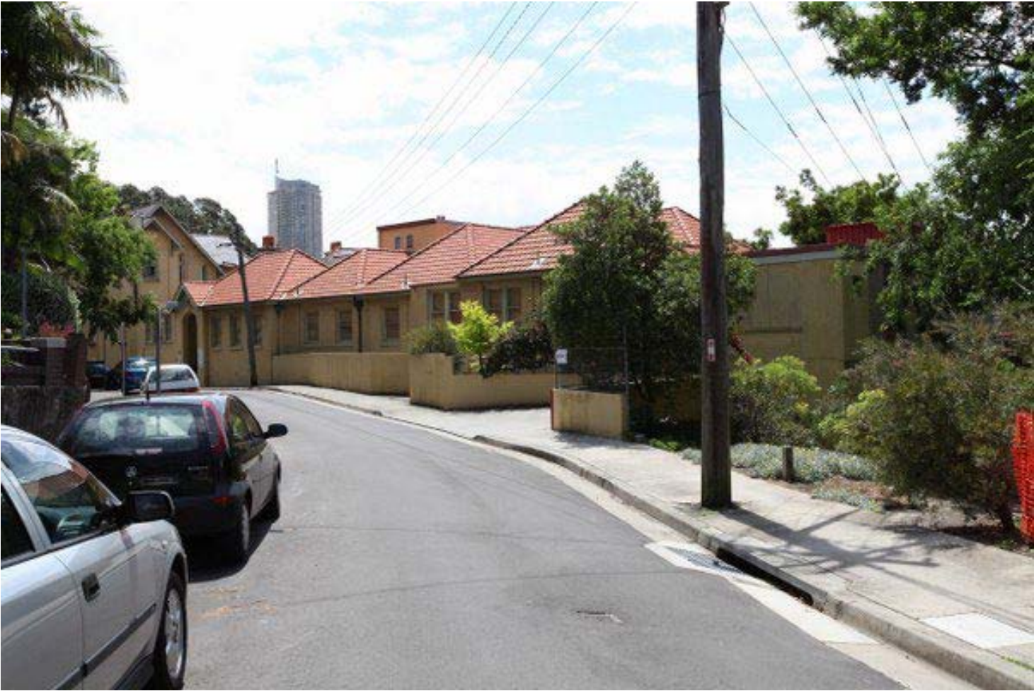
Existing View 3 - Cooper St & Stephen St