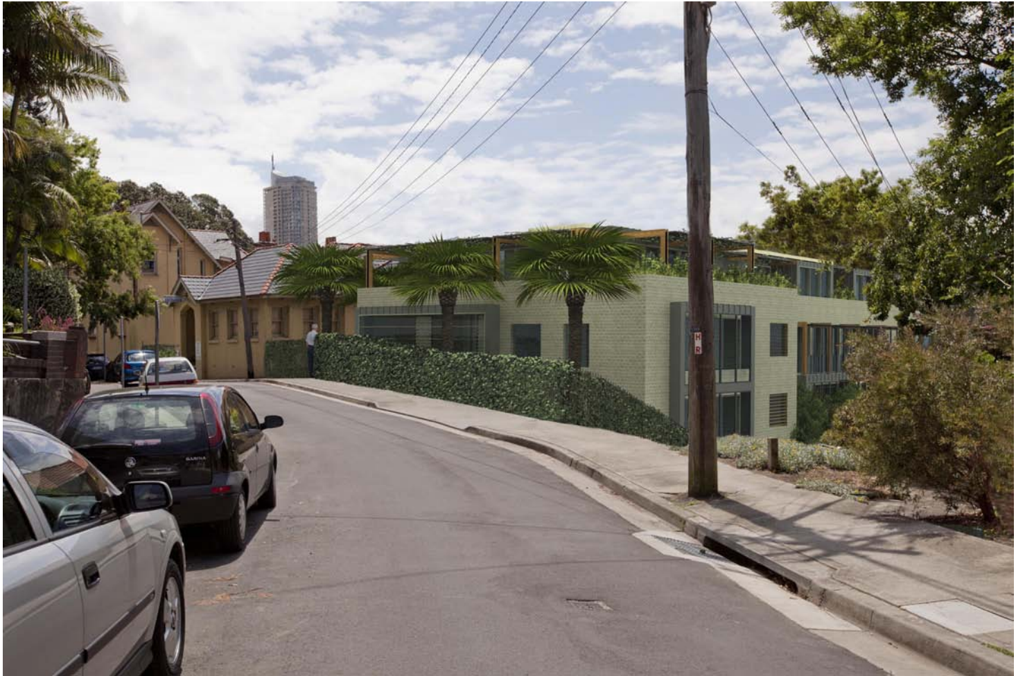
Proposed View 3 - Cooper St & Stephen St