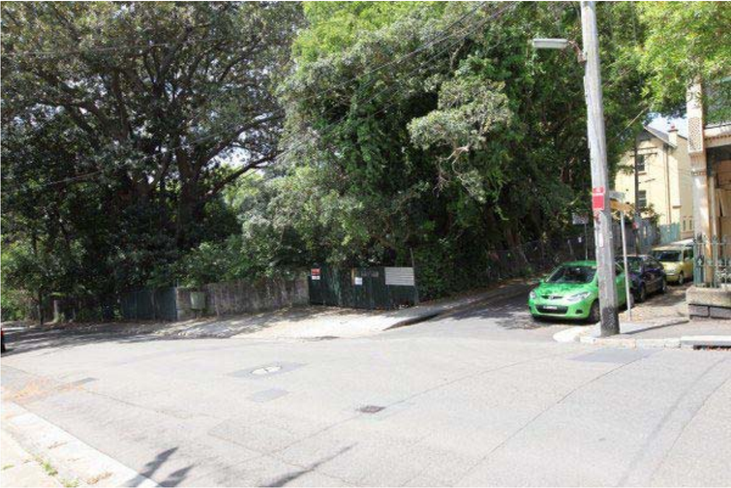
Existing View 1 - Corner of Brown St & Cooper St