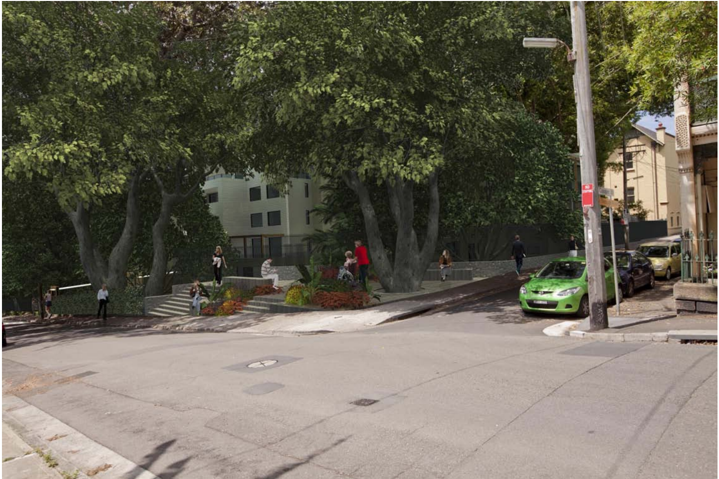
Proposed View 1 - Corner of Brown St & Cooper St