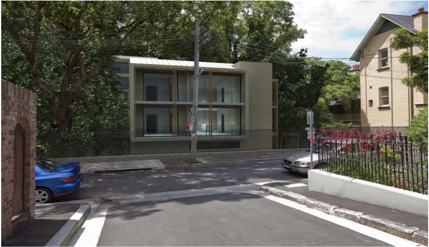
Proposed View 2 - Cooper Lane & Cooper St