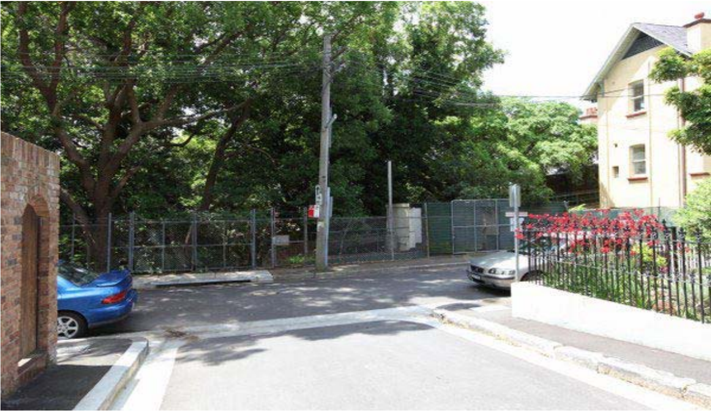
Existing View 2 - Cooper Lane & Cooper St