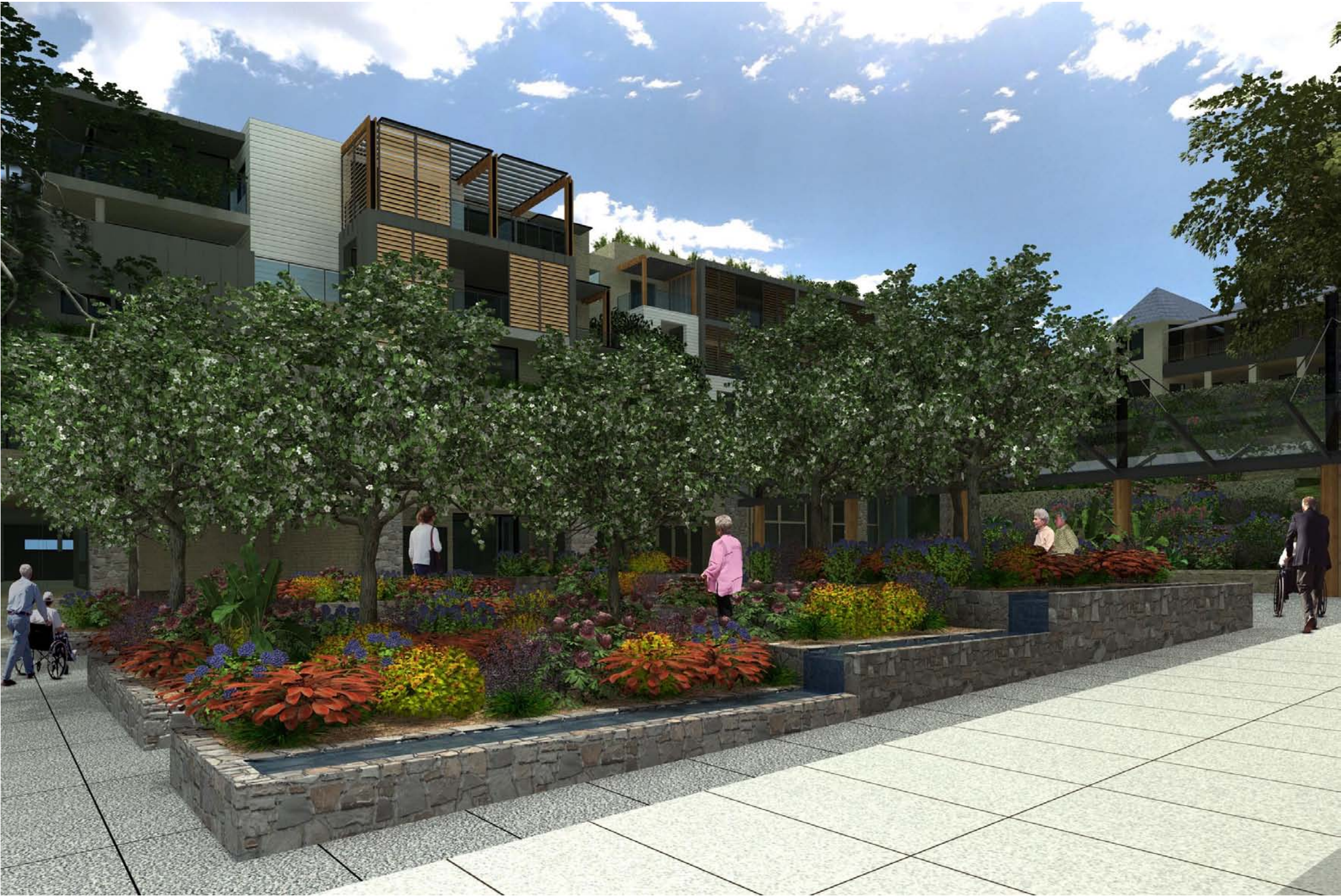
Proposed View 11 - Internal Piazza looking East