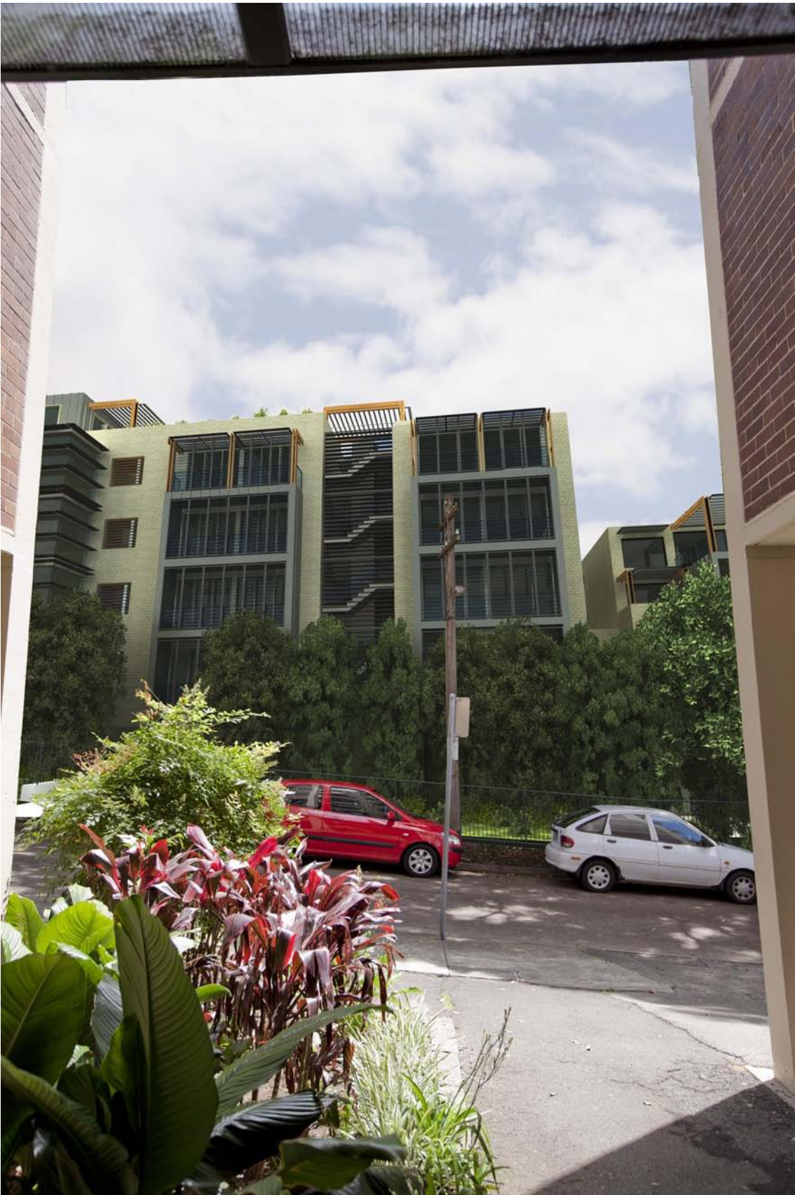
Proposed View 4 - Stephen St