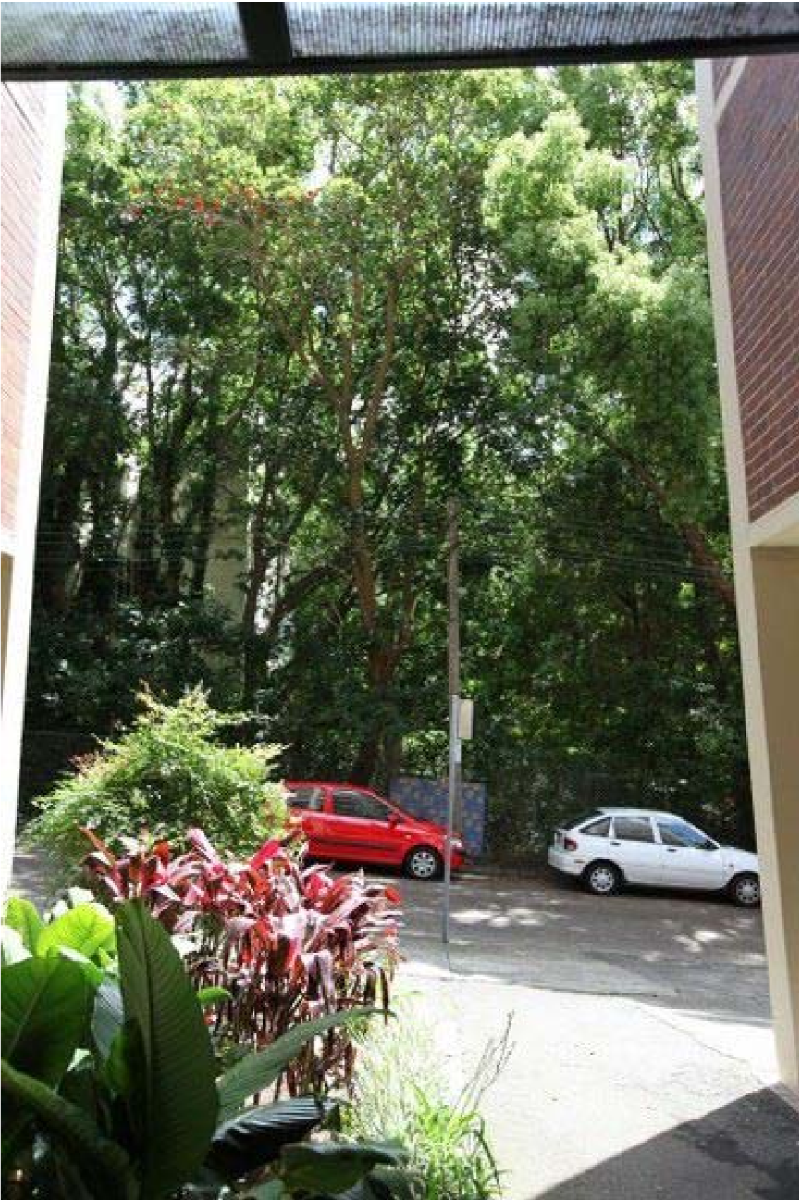
Existing View 4 - Stephen St