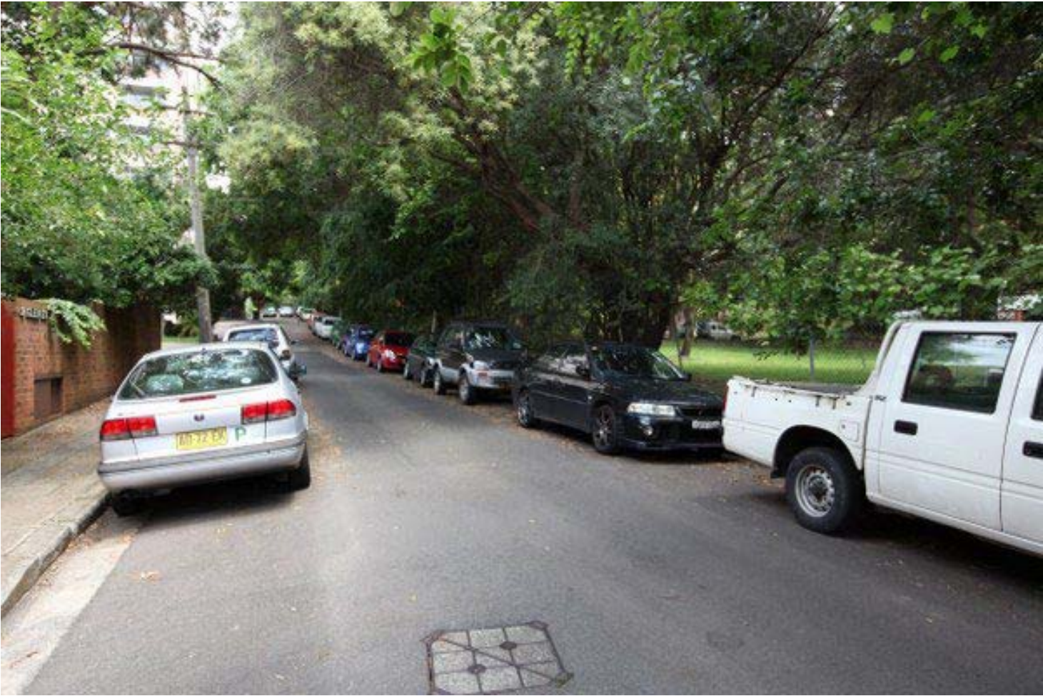
Existing View 7 - Stephen St & Dillon Reserve