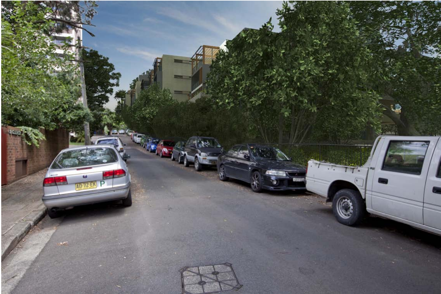
Proposed View 7 - Stephen St & Dillon Reserve