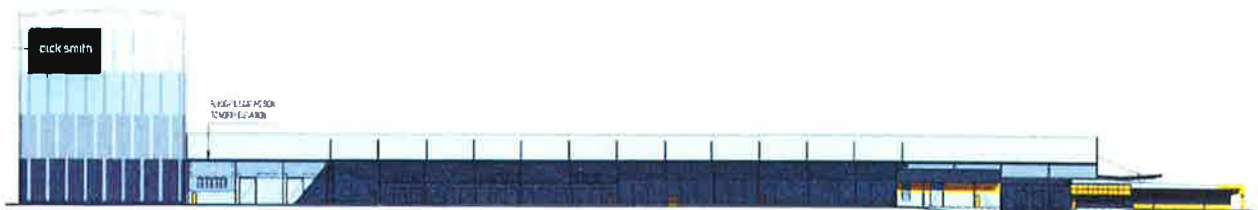
Figure 2 East Elevation of the Distribution Centre with the approved Stage 2 high bay extension.

The modification is requested on the basis that the high bay storage area is not required for the Masters Home Improvements Distribution Centre.