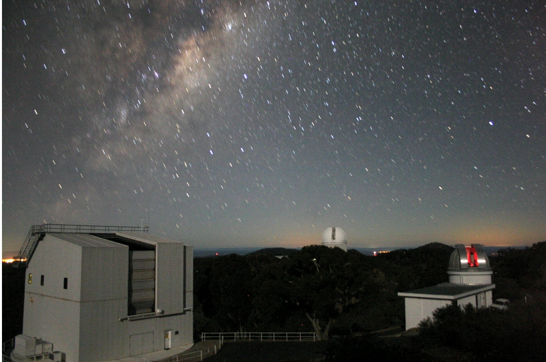
Figure 3. A 5-minute digital exposure from Siding Spring Observatory, showing the horizon illumination from Coonabarabran (far left), Newcastle (centre) and Sydney (right). (Bob Shobbrook)

remains the Orana Regional Environmental Plan (REP) No.1. This covers an area of radius 100 km centred on the Anglo-Australian Telescope. In the central part of the REP zone, 'full cut-off' outdoor fixtures (which permit only illumination below the horizontal plane) are mandated within the Shire by the DCP. Beyond the REP zone, however, there is no overarching legislation to protect the skies of the observatory, and the night-time glow of the Sydney–Newcastle conurbation can be seen, as predicted by Cinzano's model (Figure 3).