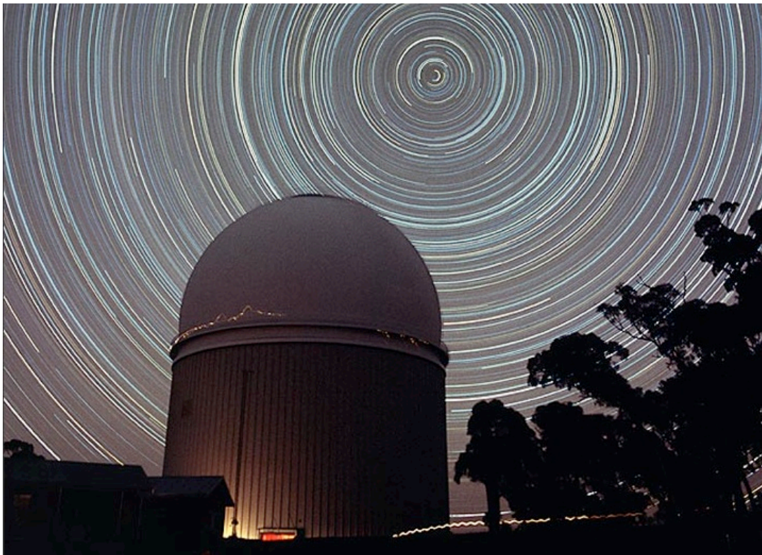
Figure 1. A 9.5-hour photographic exposure of the AAT dome at night showing star-trails and the natural luminosity of the sky. (David Malin)

Any celestial object that an astronomer wishes to investigate is superimposed on this sky background, and usually the background dominates the observation. Often, astronomers are looking at faint objects whose brightness is less than one percent of the natural sky background. Any increase in the background glow due to artificial light simply renders these objects invisible. In that respect, there are few natural environments as sensitive to pollution as the night sky.