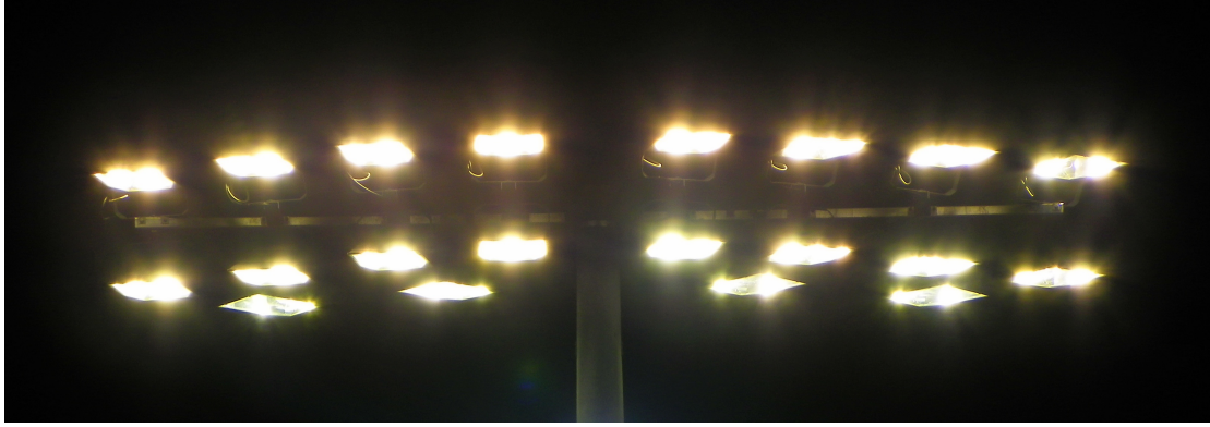
Figure 4. The head of one of four masts carrying full cut-off light fittings at the Victoria Oval in Dubbo. The illumination is of TV broadcast standard, but is confined entirely to the playing surface.