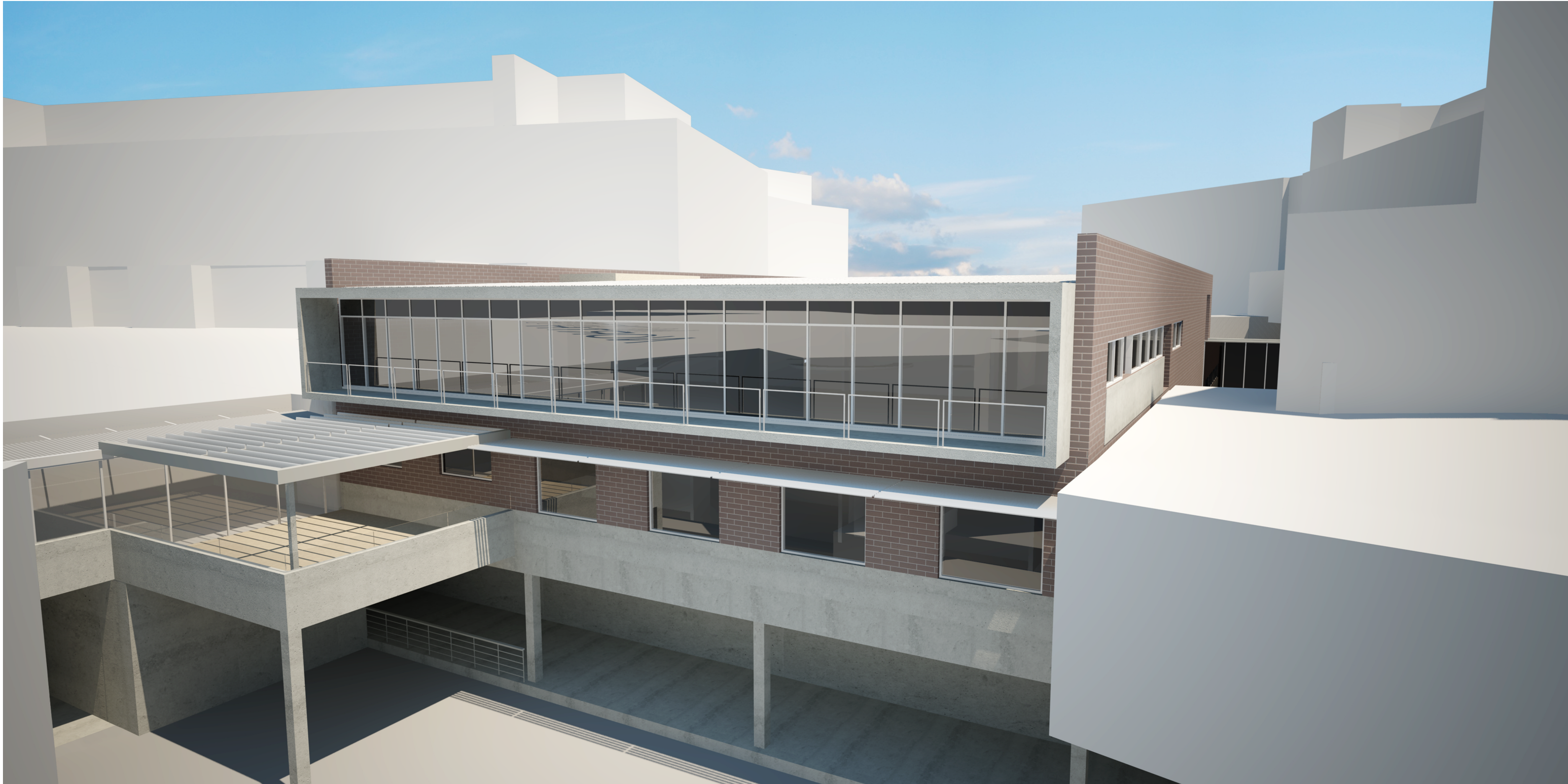
IMPRESSION 01 NORTH ELEVATION