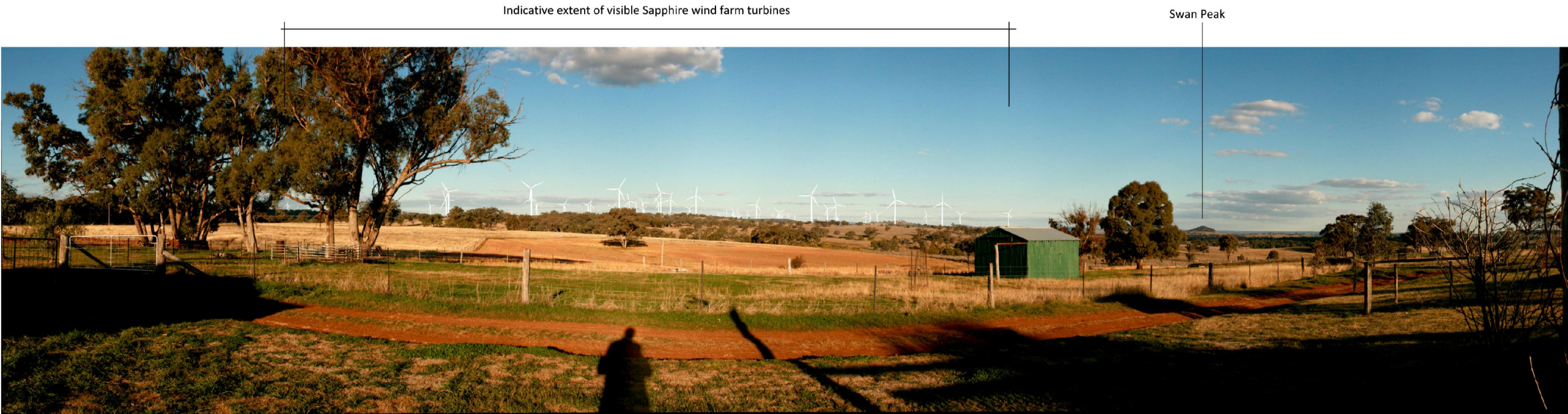
Photo B: Viewpoint PM7A Extended panorama Proposed view north east to south east from Spring Creek Distance to nearest Sapphire turbine: 1.8km Number of Sapphire turbines visible: 60

General Notes: Viewpoint PM7A, Spring Creek Coordinates: Easting 341823, Northing 6715905 Photo date: 2nd August 2011, 4.15pm Elevation: 831m AHD (+/- 4m) Camera: Canon EOS 4000, 30mm 1:1.4DC Lens (equivalent to 35mm SLR Camera with 50mm lens). F/16 at 1/500 sec Original Page Format: A1 Landscape This photomontage represents the likely view of the proposed Sapphire wind farm.