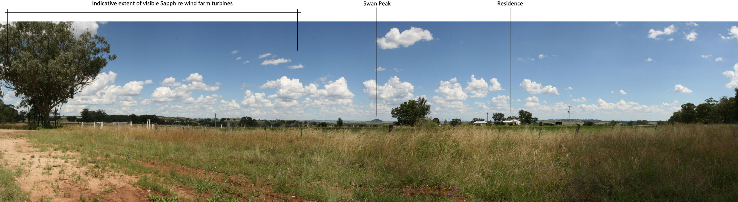
Photo A: Viewpoint PM7 Extended panorama Existing view north east to south from Kings Plains Road