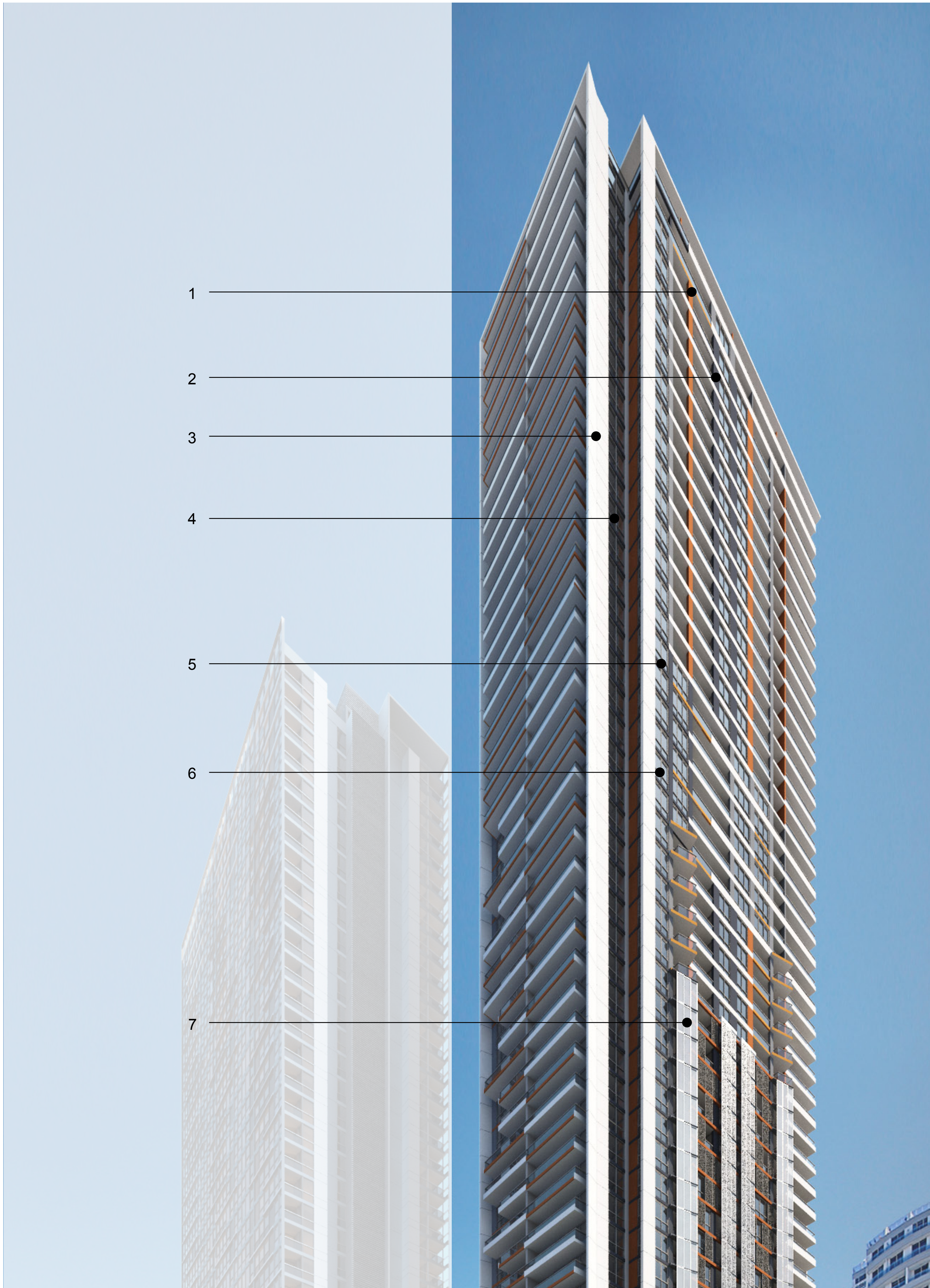
1 BUILDING 1 FACADE FINISHES