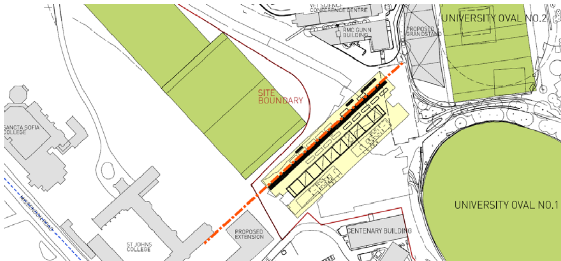
Figure 1 - Alignment of new building and St John's College shown dashed.