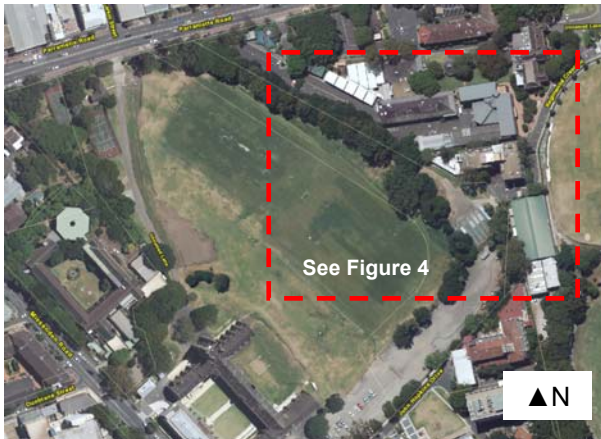
Figure 3 - St John's College showing existing row of trees adjacent to the oval.