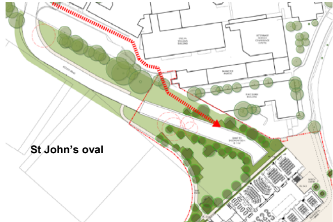
Figure 4 - Public Domain Plan (LA-9400 Rev 6) shows the proposed access road. The approved road is shown dashed.

The relocation of the access road is not supported because: