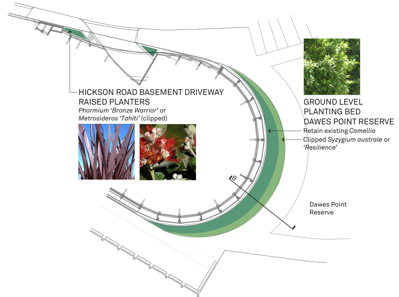
PLAN 2: GROUND LEVEL EXTERIOR PLANTING

Note: All plans and sections are not drawn to scale.