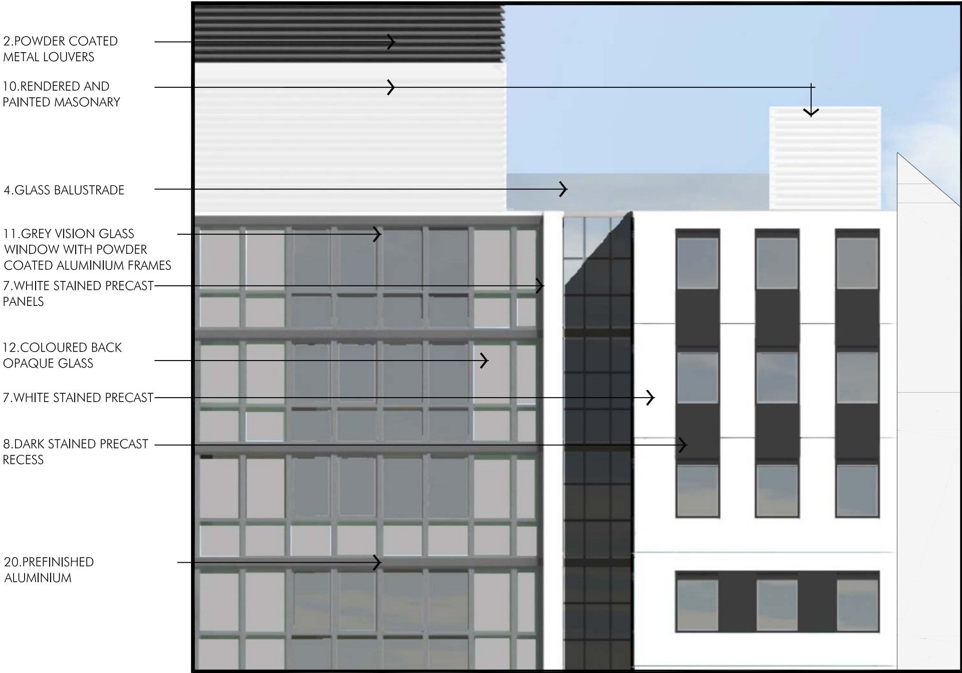
UPN: EAST PART ELEVATION