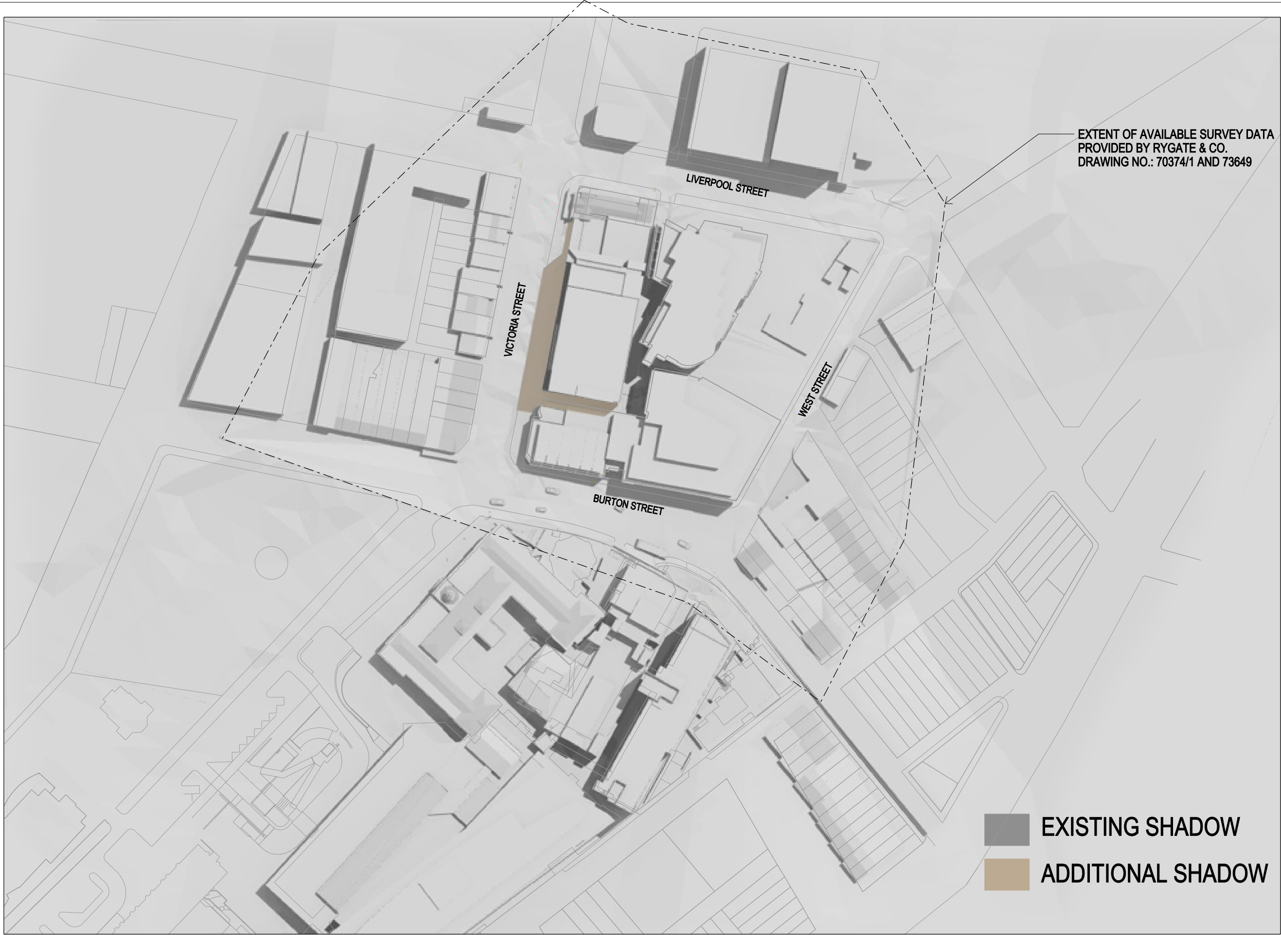
DECEMBER 21 - 12:00 PM