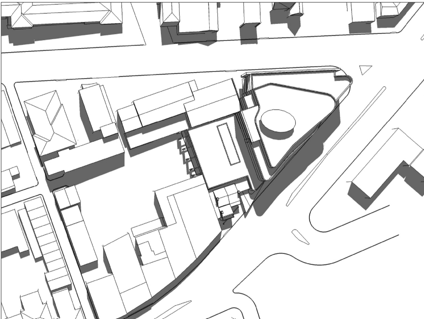
PROPOSED EQUINOX 12:00 NOON