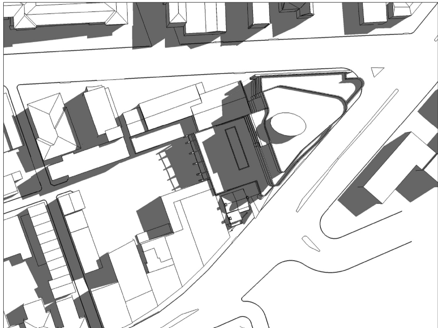
PROPOSED EQUINOX 9:00 AM