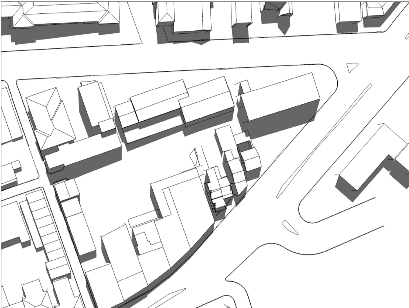
EXISTING EQUINOX 12:00 NOON