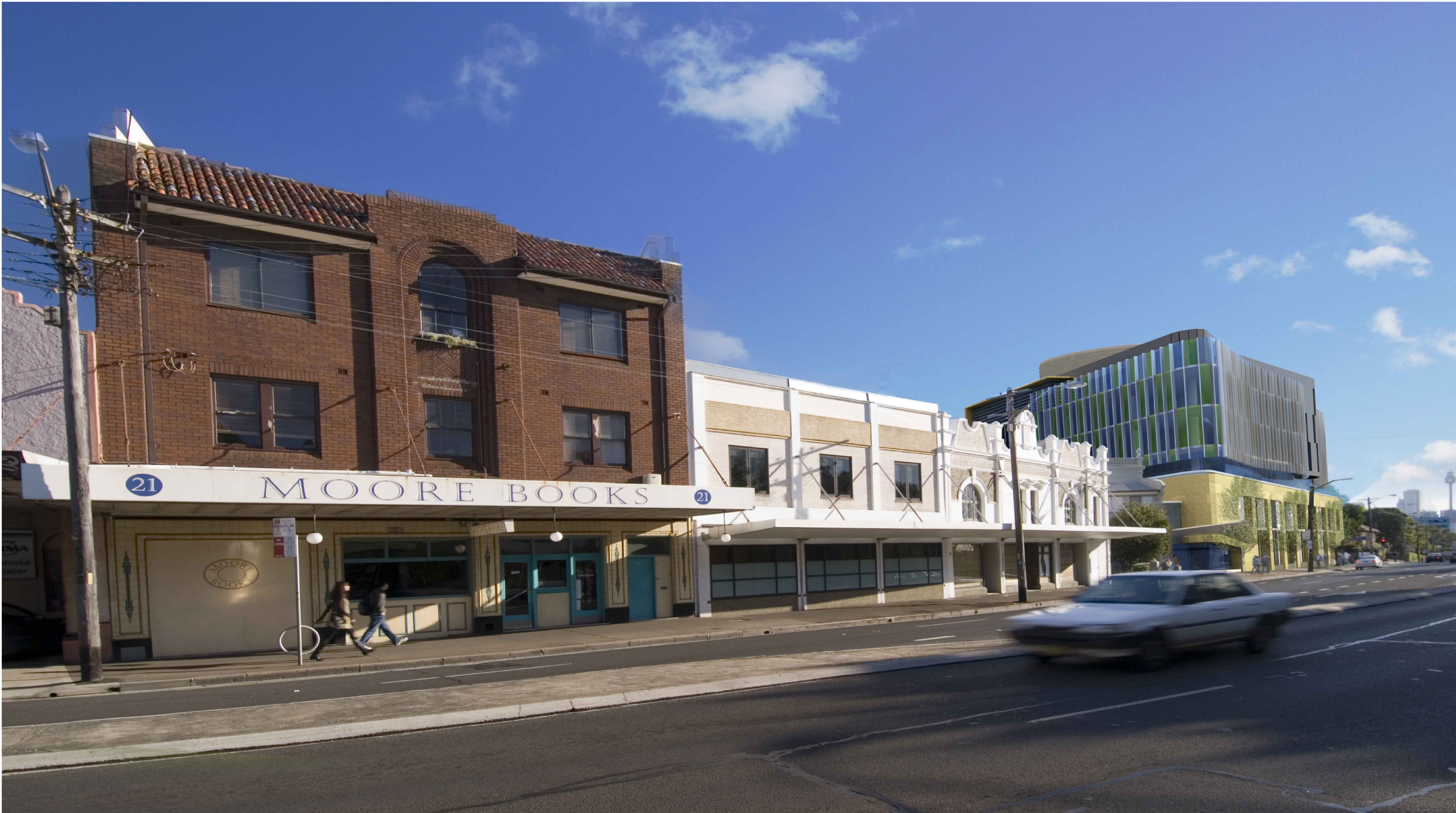
VIEW FROM KING STREET TOWARDS CITY ROAD