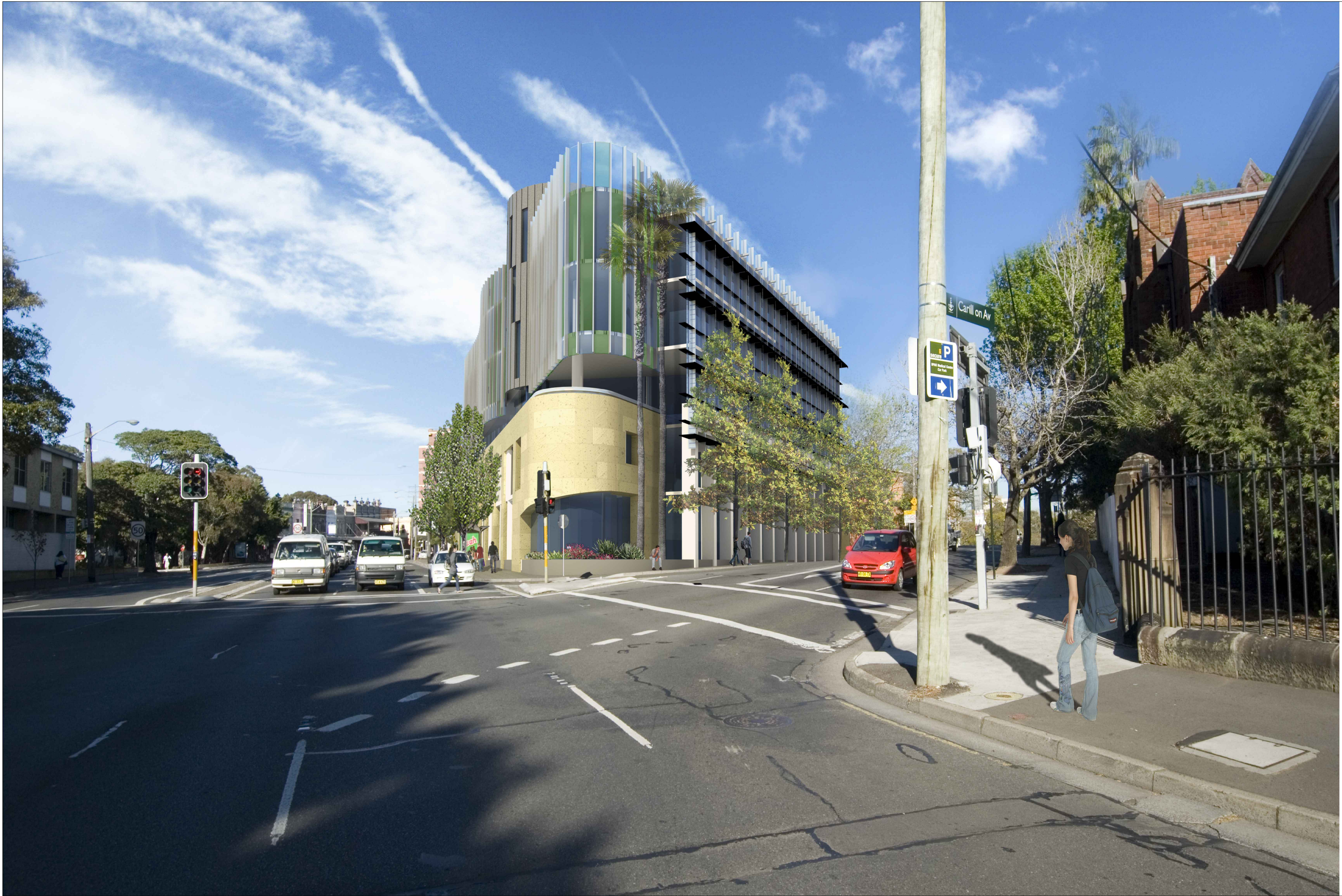
VIEW FROM CITY ROAD TOWARDS CARILLON AVENUE