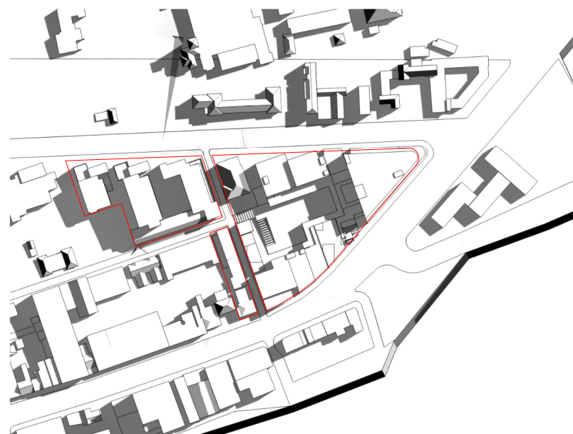
PROPOSED EQUINOX 9 AM