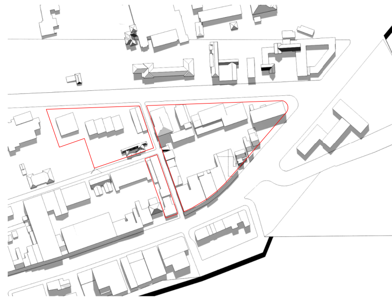
EXISTING EQUINOX 12 NOON