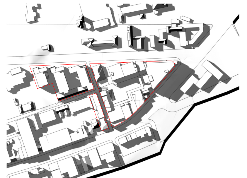
PROPOSED EQUINOX 3 PM