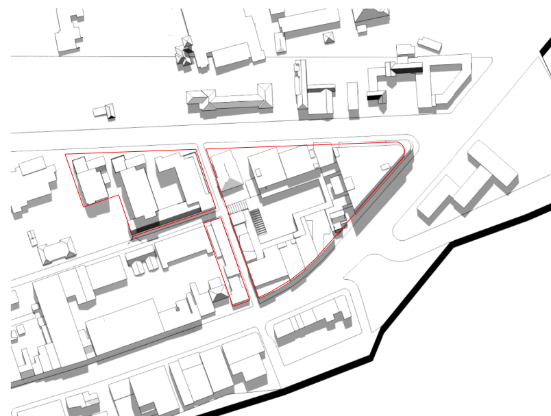
PROPOSED EQUINOX 12 NOON