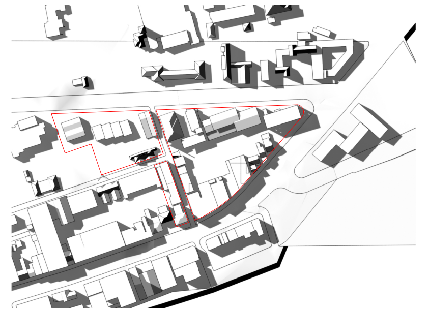
EXISTING EQUINOX 3 PM