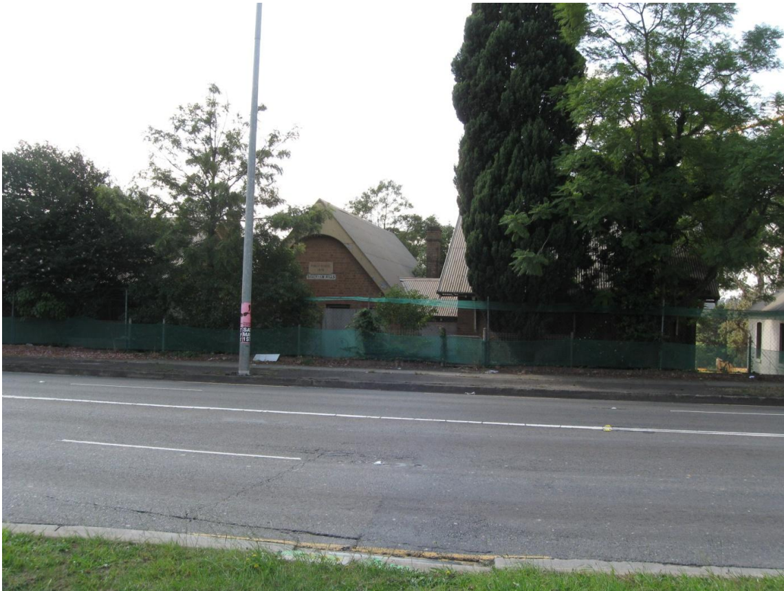
Figure F8: View from 266-268 Windsor Road showing Baulkham Hills Public School. View north