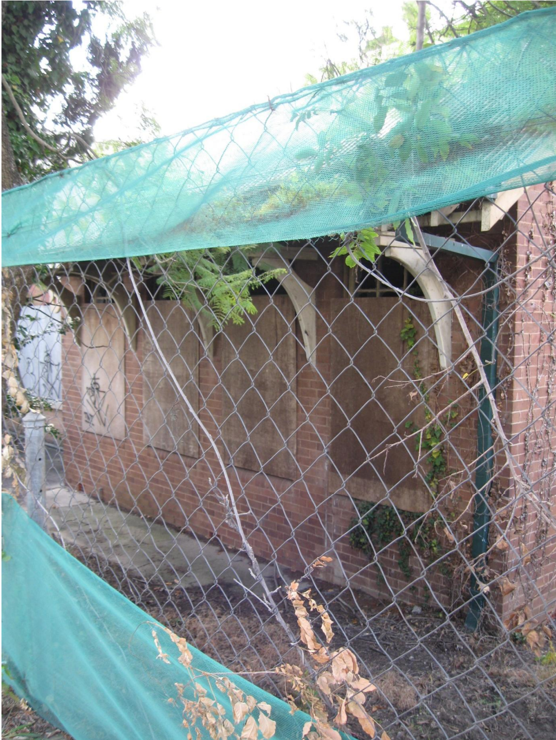
Figure F9: View of Baulkham Hills Public School indicating proximity to footpath. View north.