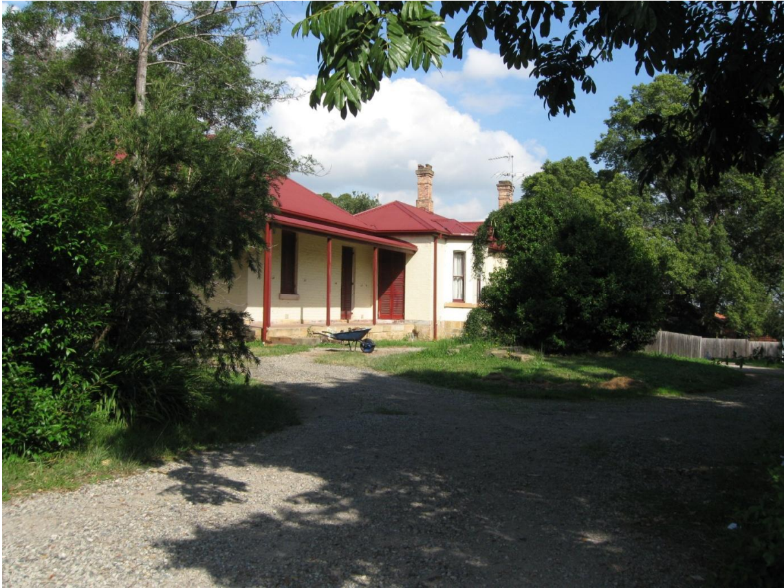
Figure F6: View of 266-268 Windsor Road showing bay window. View south west.