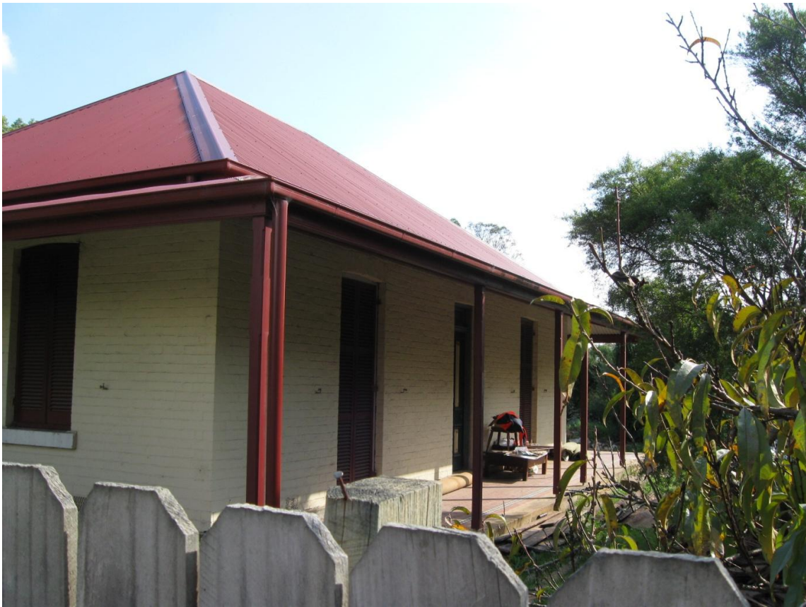
Figure F5: View of 266-268 Windsor Road from driveway of 264 Windsor Road. View: north west.