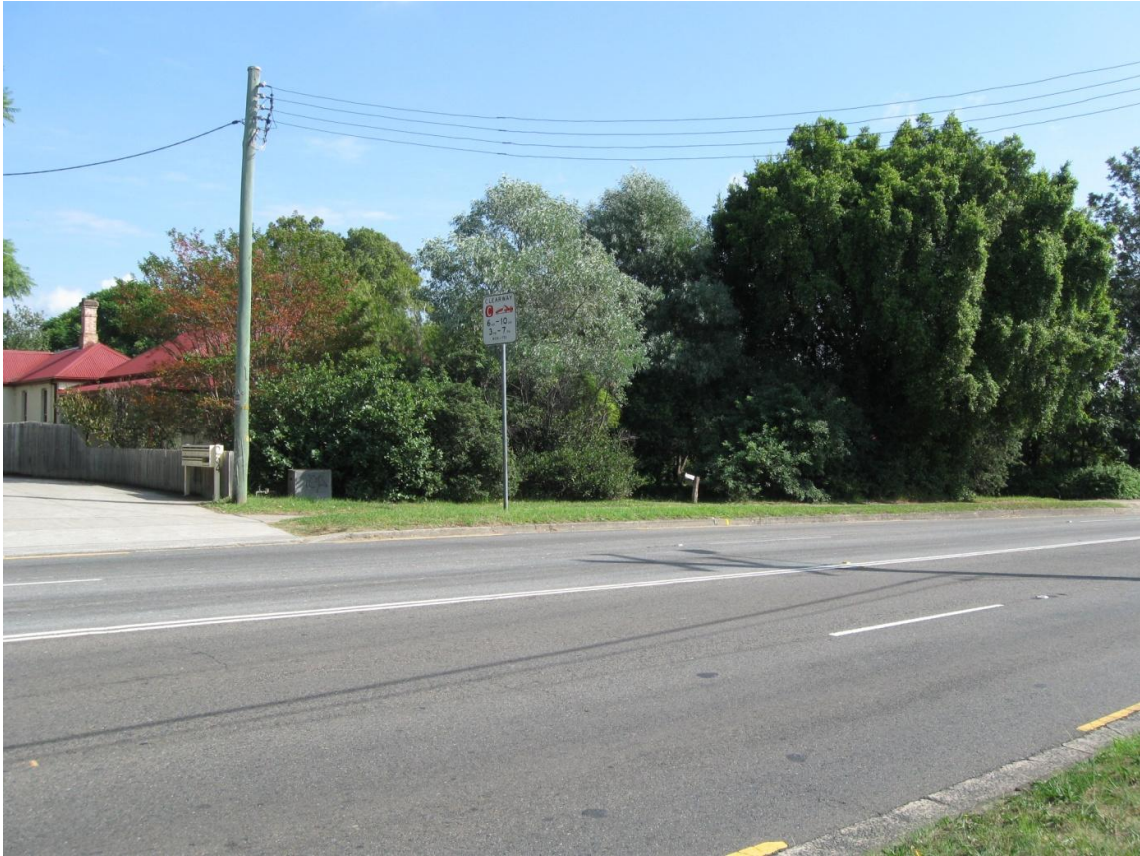
Figure F7: View of 266-268 Windsor Road showing effect of vegetation screening.