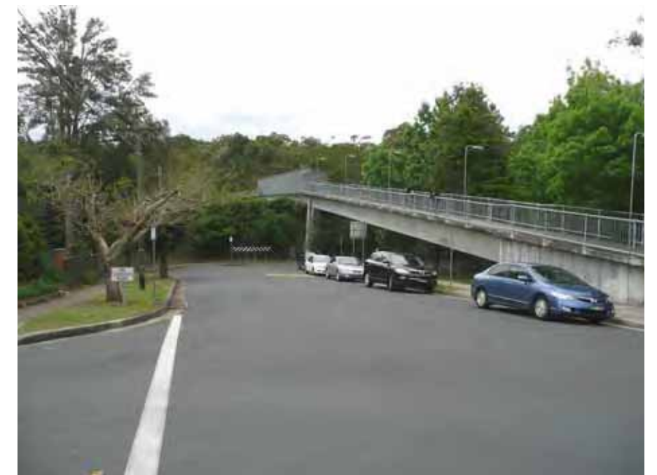
Photo 2.23 Pedestrian bridge near Epping Heights Primary School