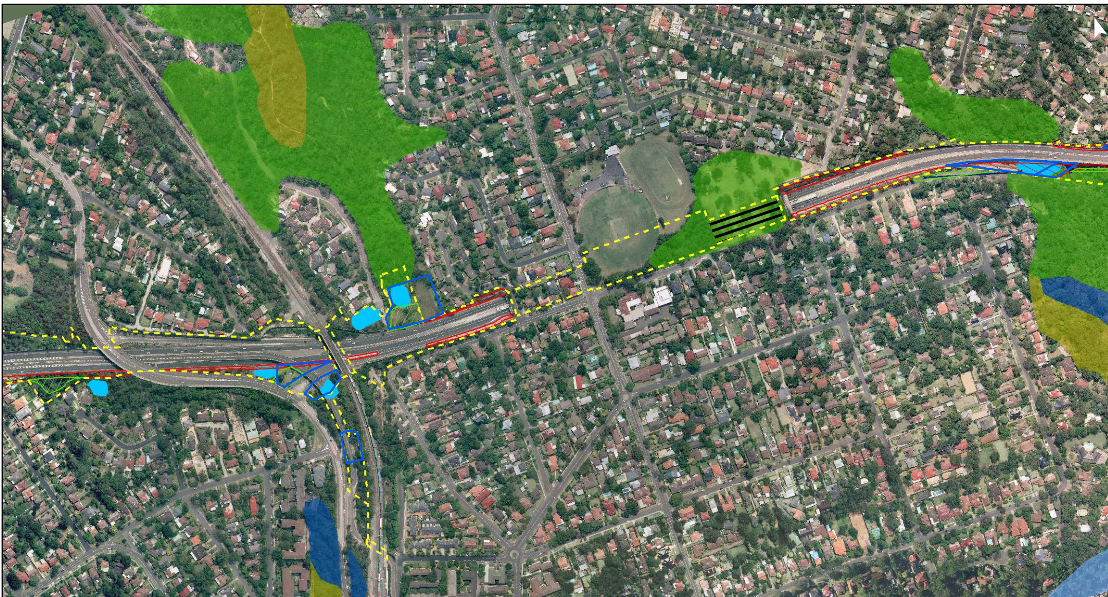
Predictive Vegetation Mapping (from datasets) and Impact Extents Map 6 of 10