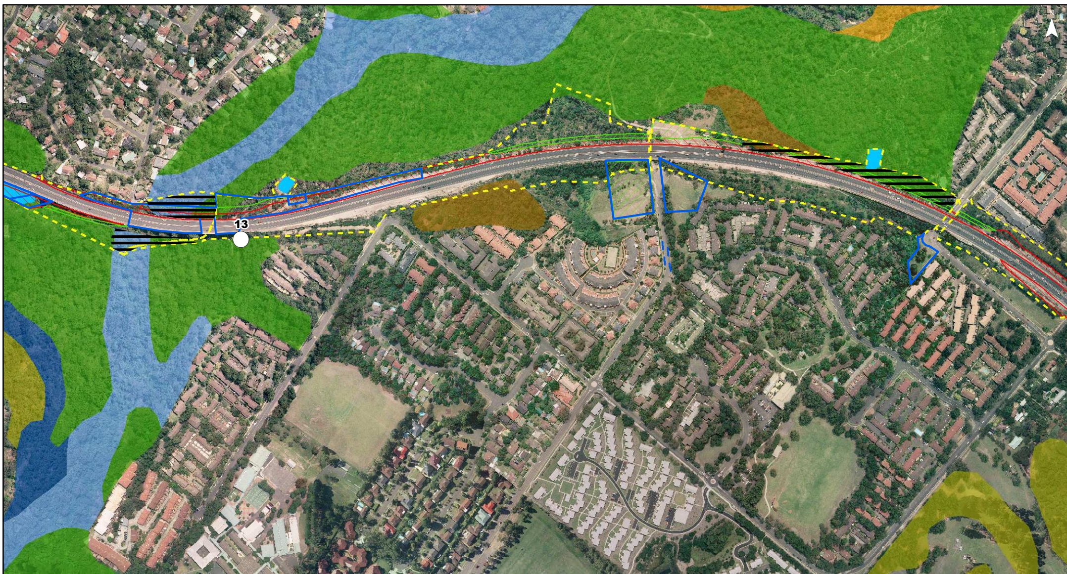
Predictive Vegetation Mapping (from datasets) and Impact Extents Map 7 of 10