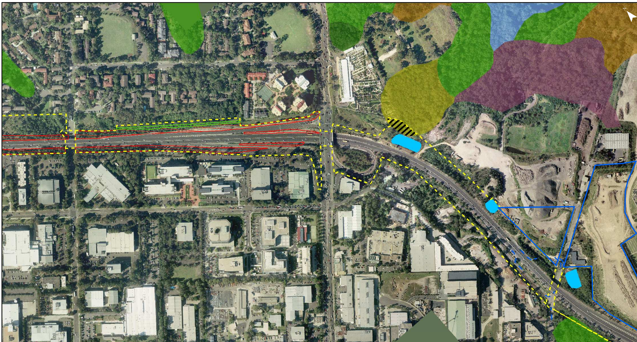
Predictive Vegetation Mapping (from datasets) and Impact Extents Map 9 of 10