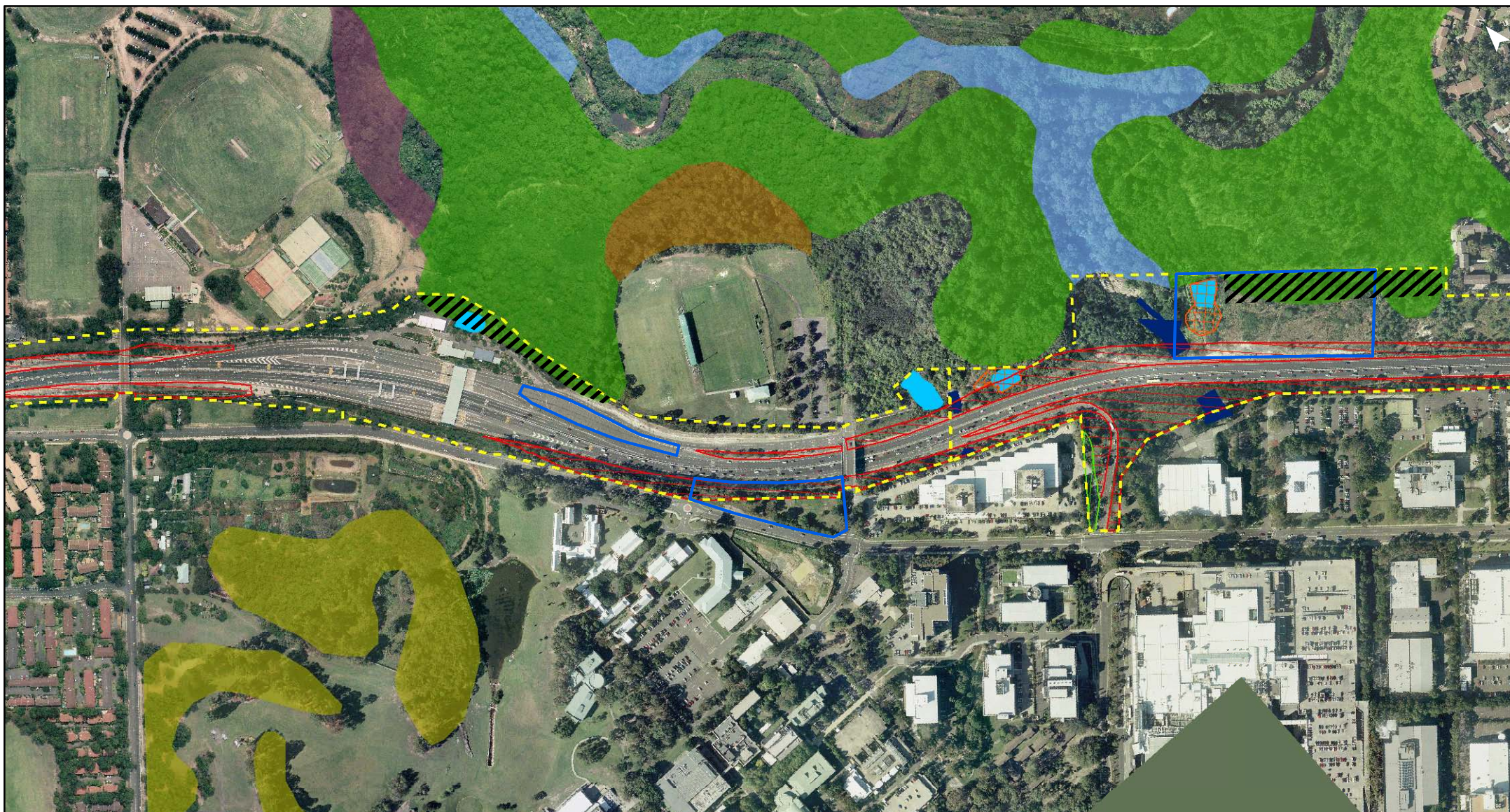
Predictive Vegetation Mapping (from datasets) and Impact Extents Map 8 of 10