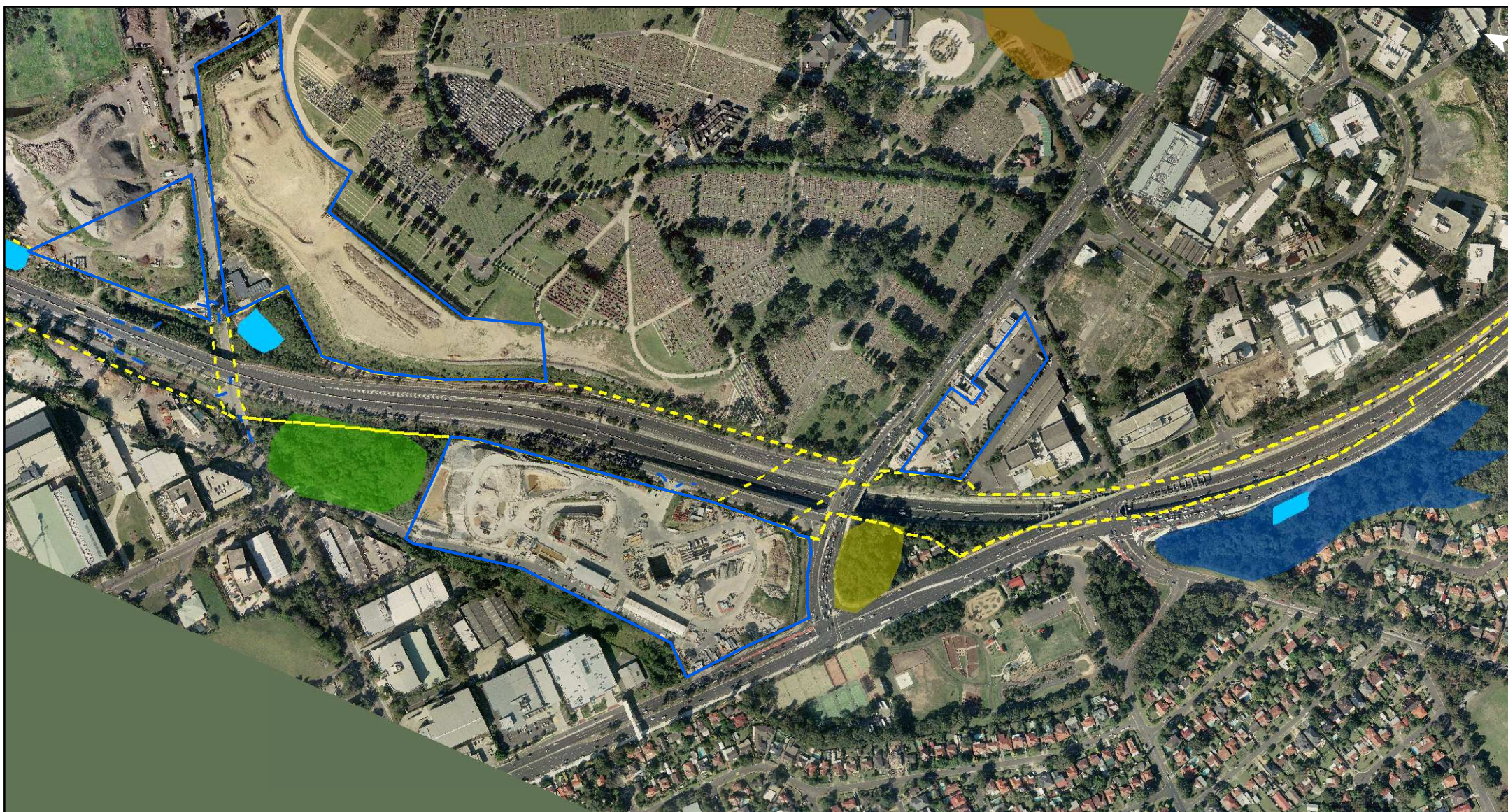
Predictive Vegetation Mapping (from datasets) and Impact Extents Map 10 of 10