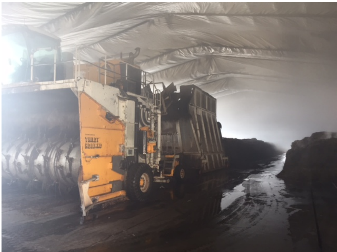
PHOTOGRAPH 4 Mixing Compost in the pre-wet shed