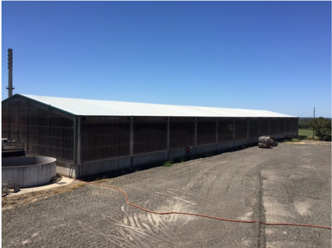
PHOTOGRAPH 9 Existing Pre-wet building