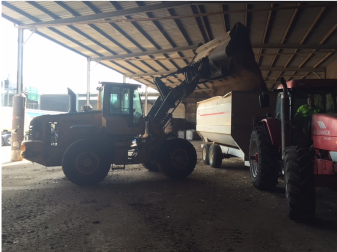
PHOTOGRAPH 3 Mixing Manure