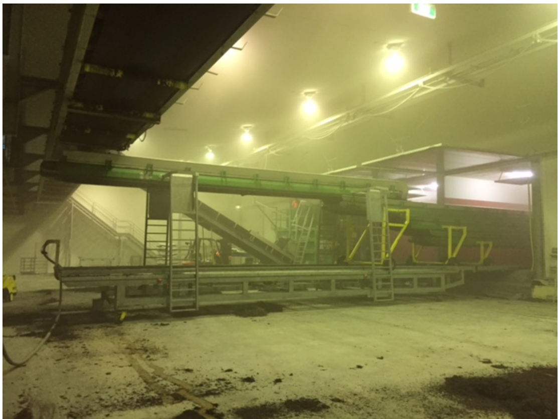
PHOTOGRAPH 6 Spawning in Phase 2 working hall