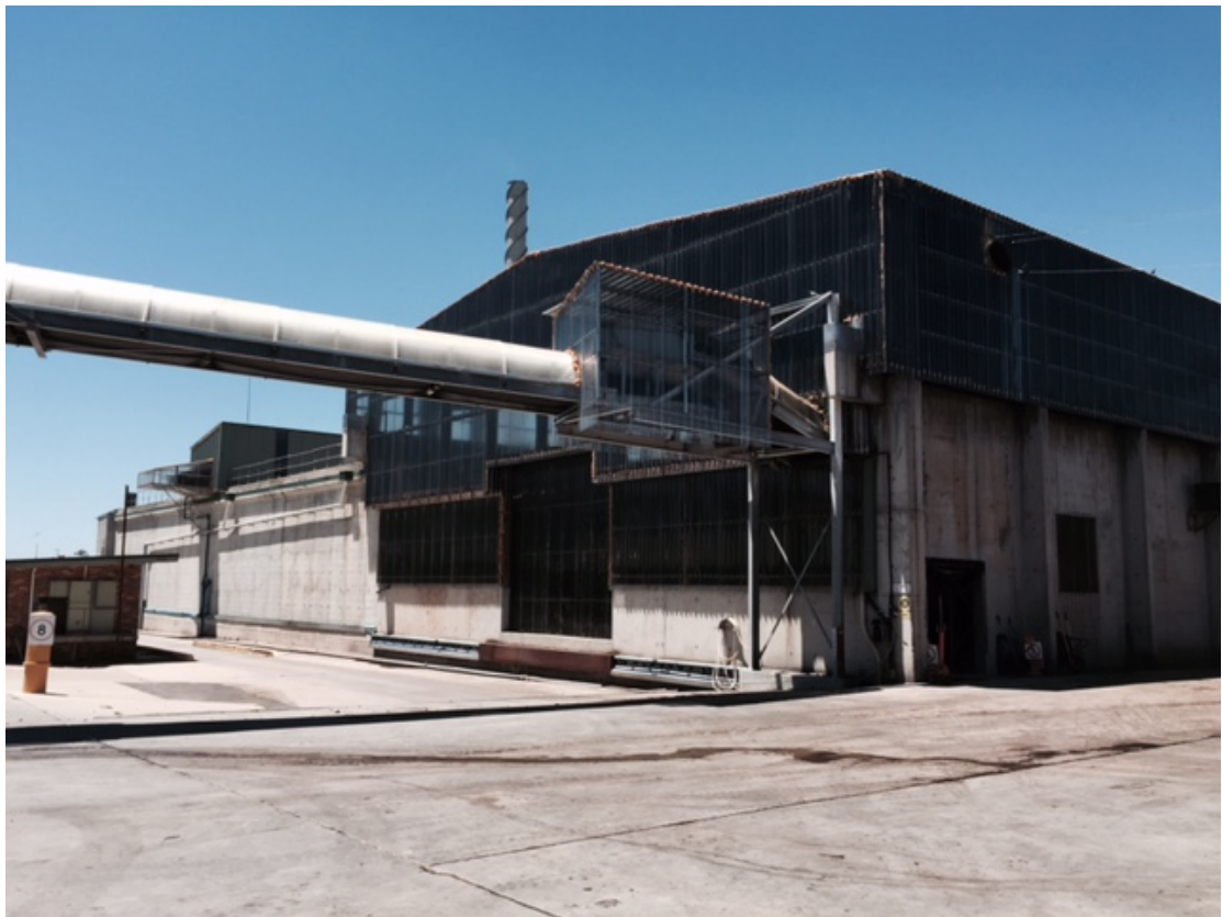
PHOTOGRAPH 8 Phase 1 building with conveyor in front and bioscrubber chimney behind