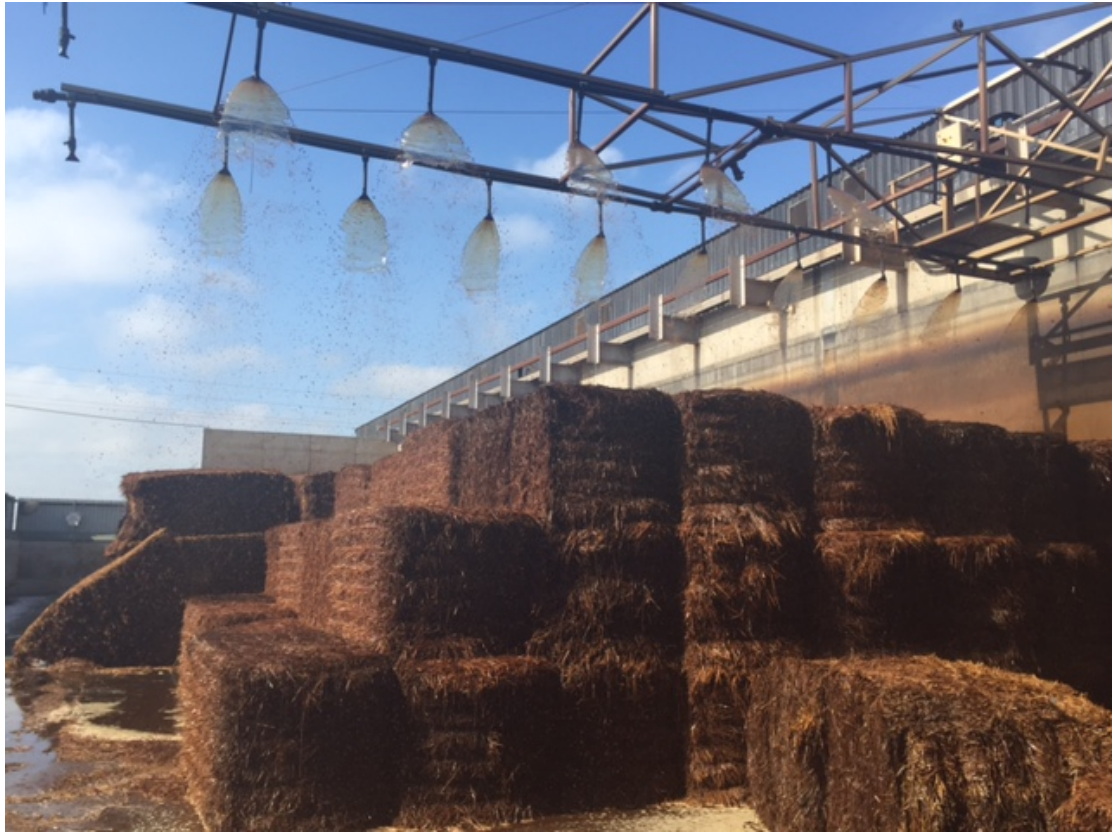
PHOTOGRAPH 1 Bale Wetting