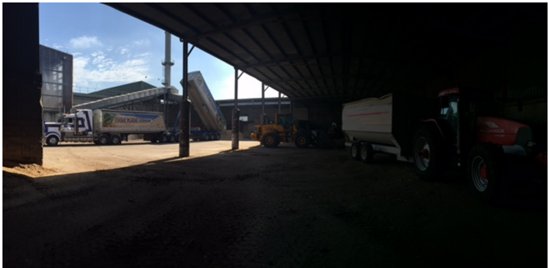
PHOTOGRAPH 2 Raw Materials Area