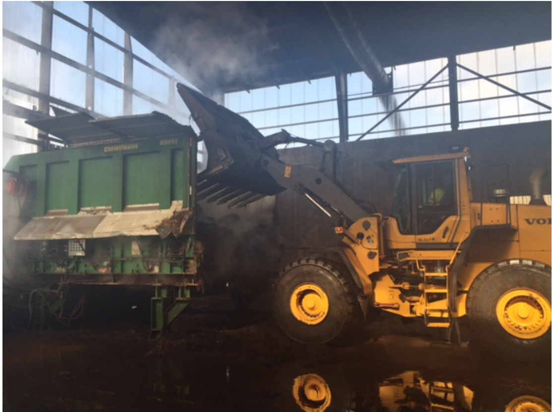
PHOTOGRAPH 5 Mixing Compost in the Phase 1 Hall