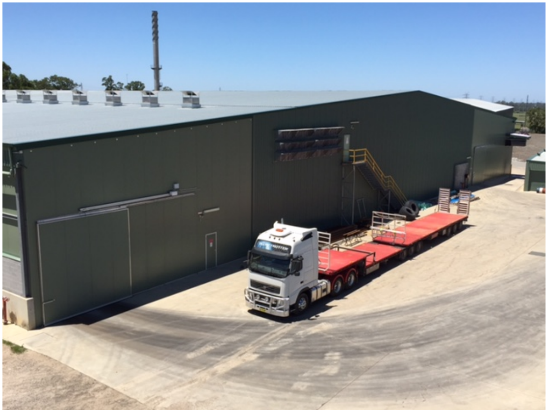
PHOTOGRAPH 10 Phase 2/3 building, western end