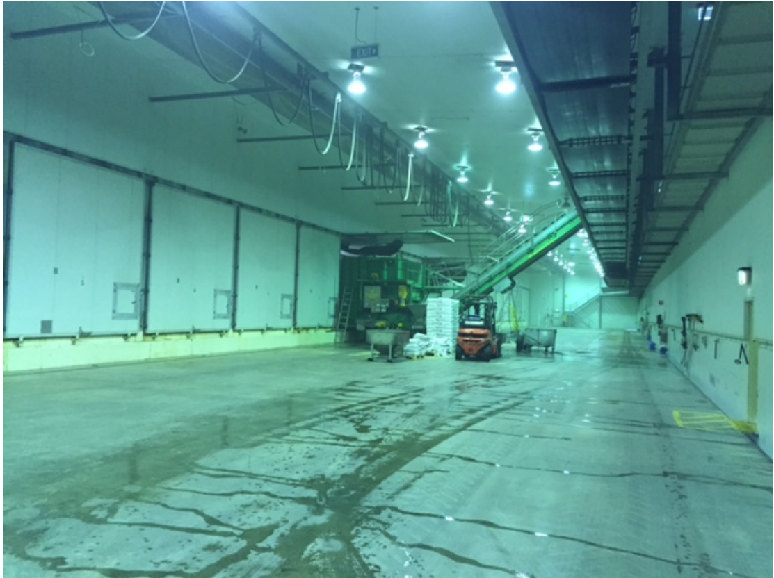
PHOTOGRAPH 7 Ship out in Phase 3 hall