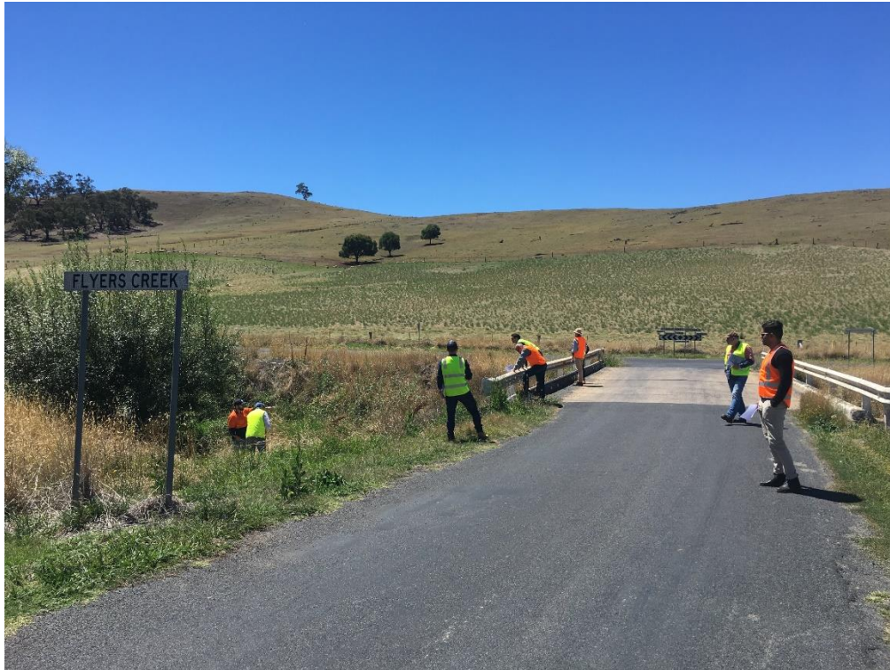
Photo F2: View from Panuara Road looking north east up Cadia Road. Power line would be located on northern side of Panuara Road and eastern side of Cadia Road on this corner.

Photo F1: View from Panuara Road looking east across Flyers Creek towards Errowanbang Road. Power line would be located on higher ground and travel between 2 clumps of trees towards the Errowanbang Road then travel across the creek.