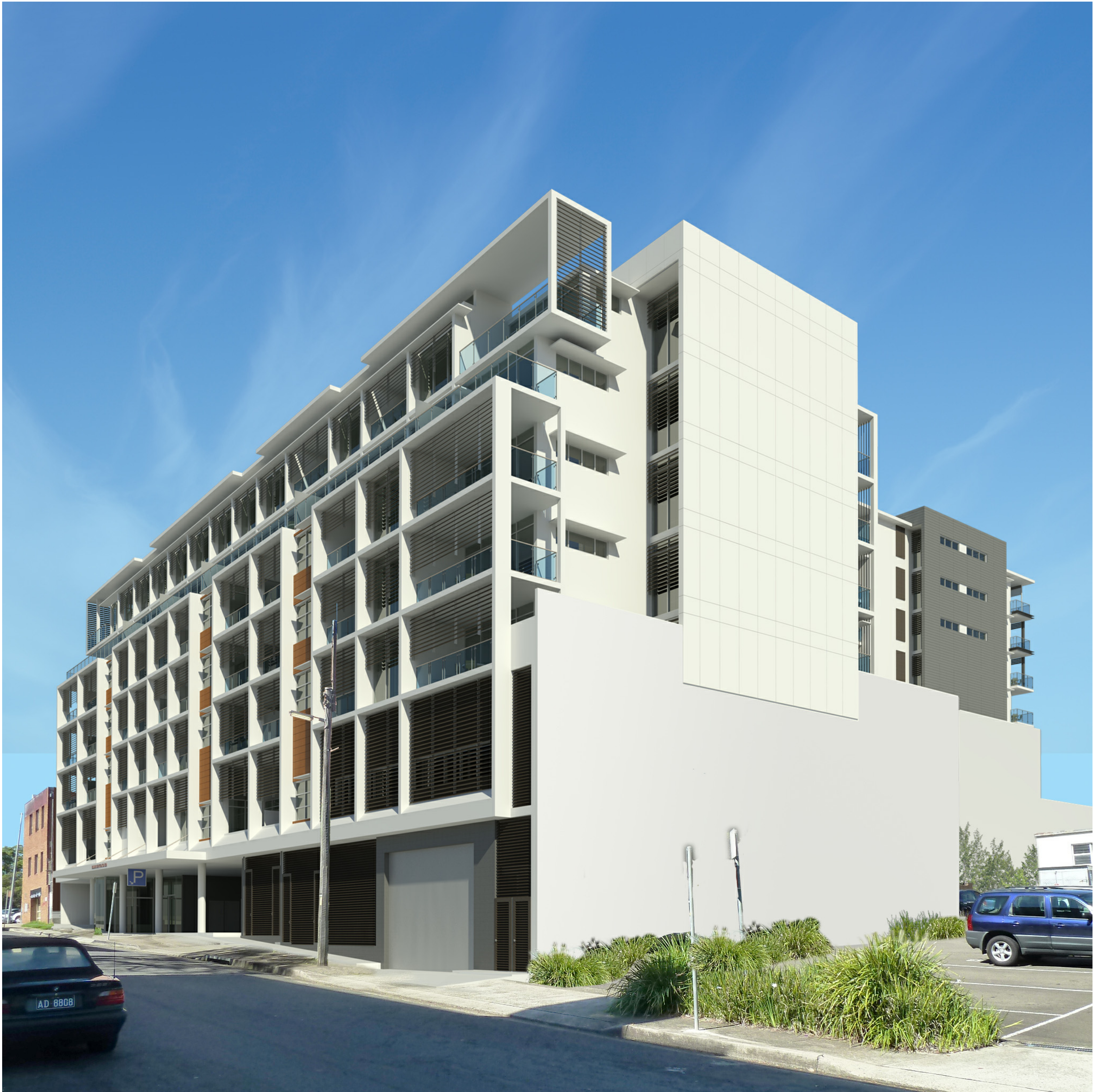
S75W SUBMISSION - MOD 3