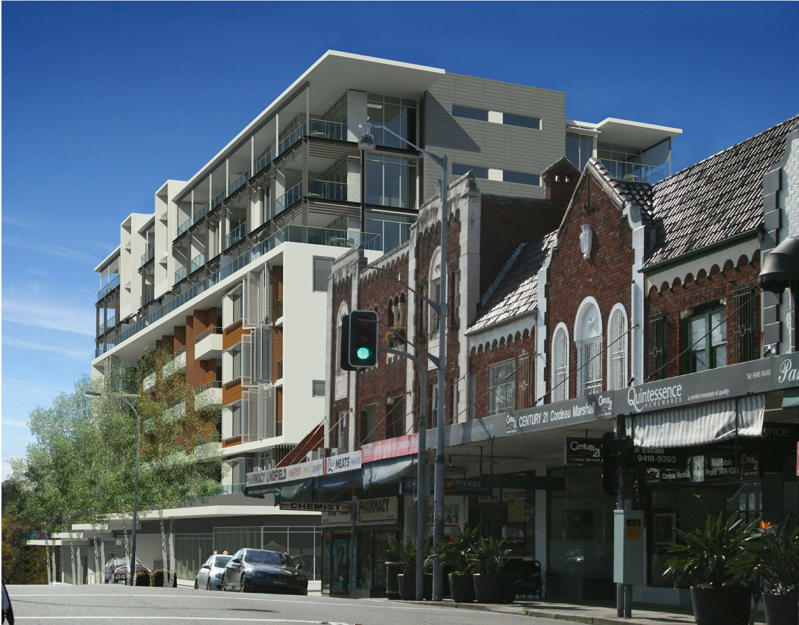
PHOTOMONTAGE 1 ( PROPOSED MOD3 SCHEME) VIEW FROM LINDFIELD AVE