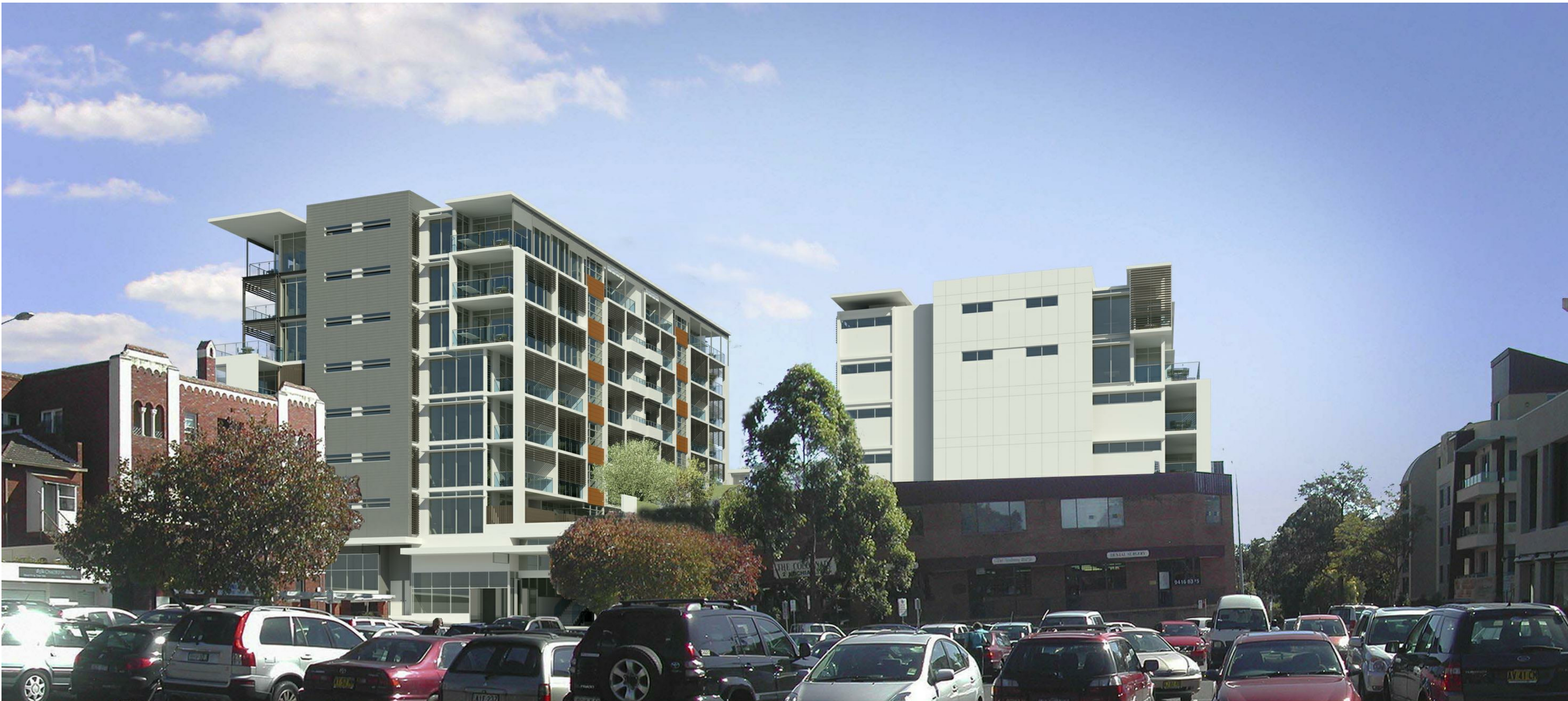
PHOTOMONTAGE 2 (S75W MOD2 PPR SCHEME) VIEW FROM SOUTH EAST CAR PARK