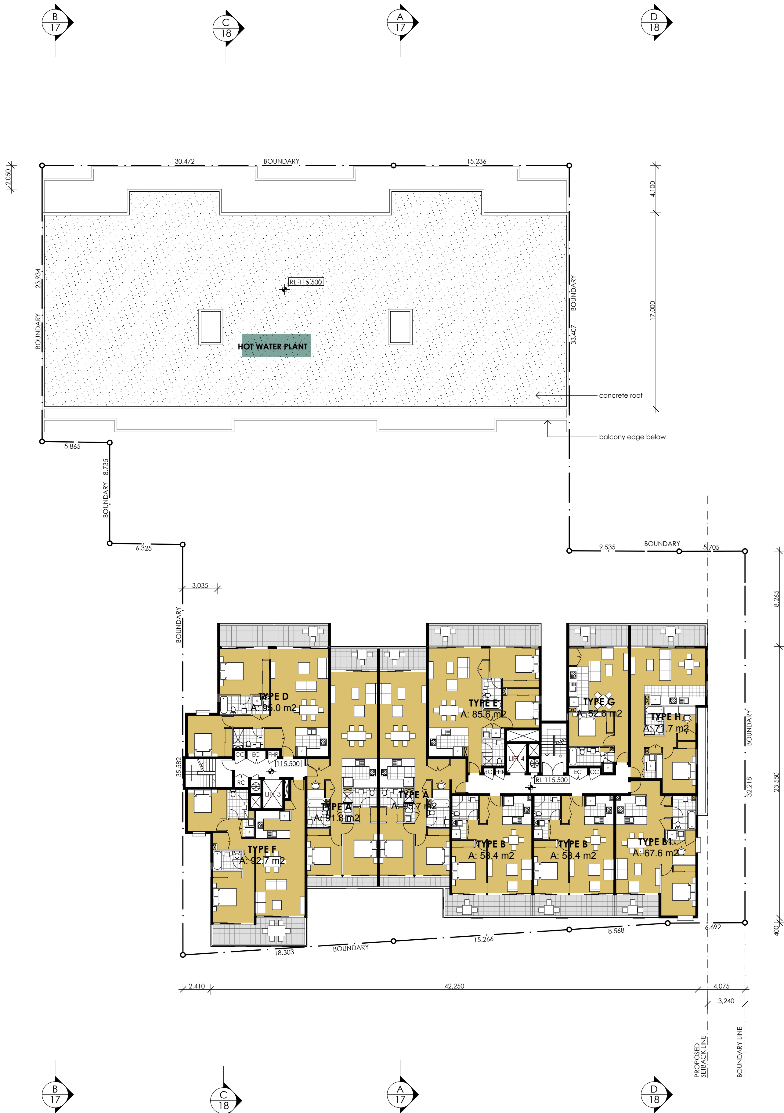
1 LEVEL 6 1:200