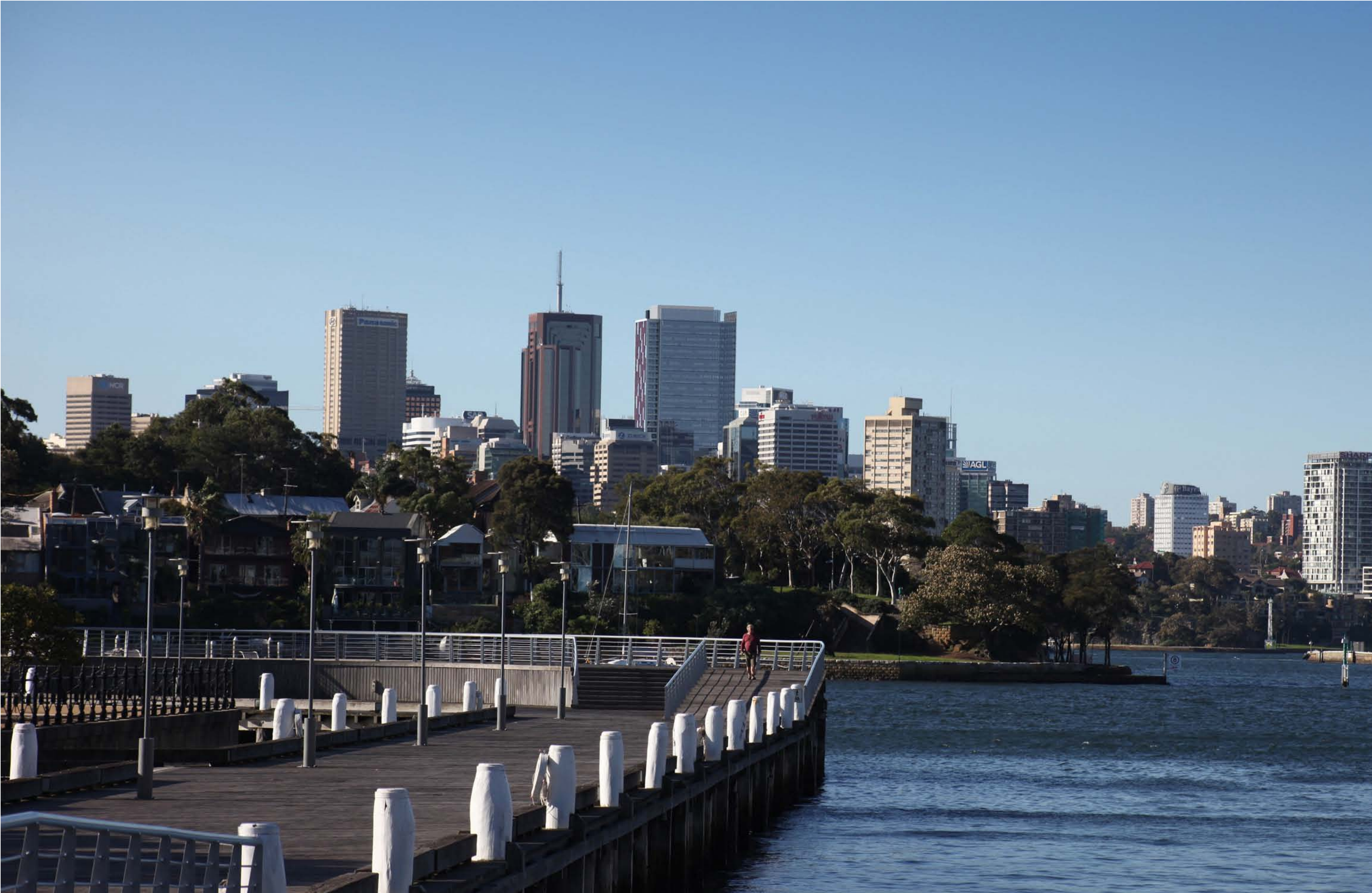
DISTANT VIEW FROM PYRMONT