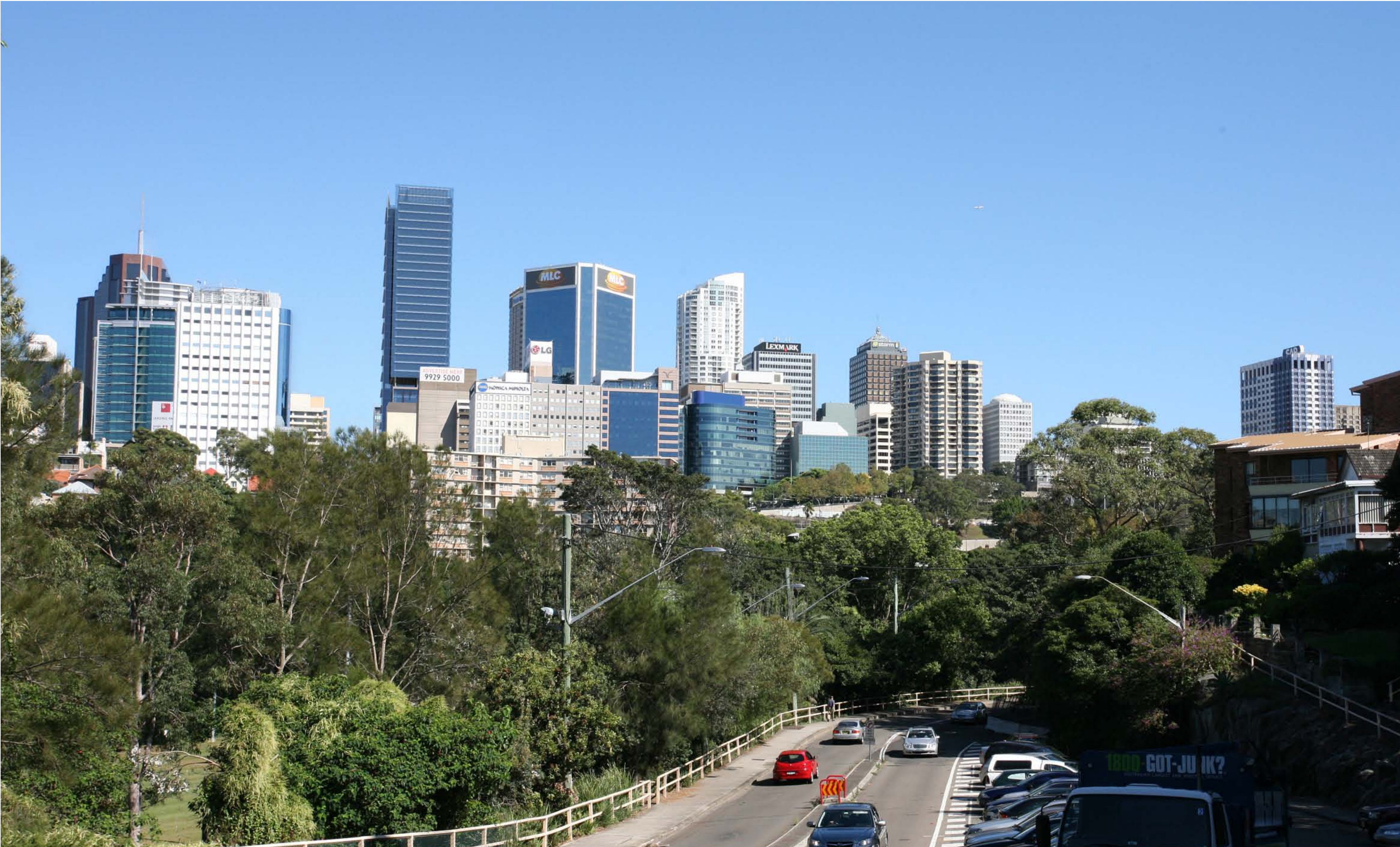
DISTANT VIEW FROM NEUTRAL BAY