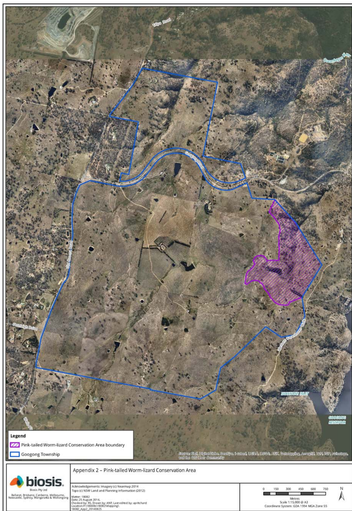
Figure 2. Proposed boundary of the Pink-tailed Worm-lizard Conservation Area