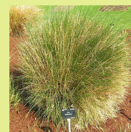
Poa labillardieri Large Tussock Grass