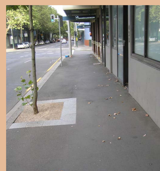
Asphalt with granite banding to tree pits