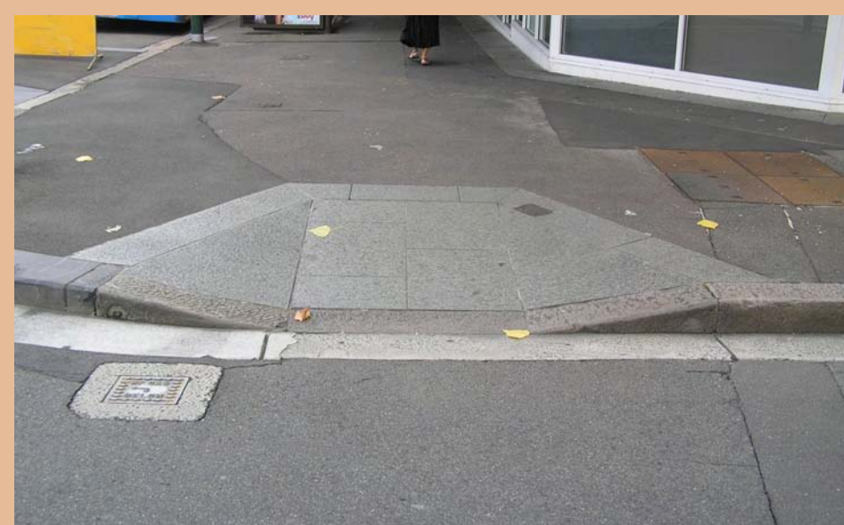
Pram ramp in granite paving