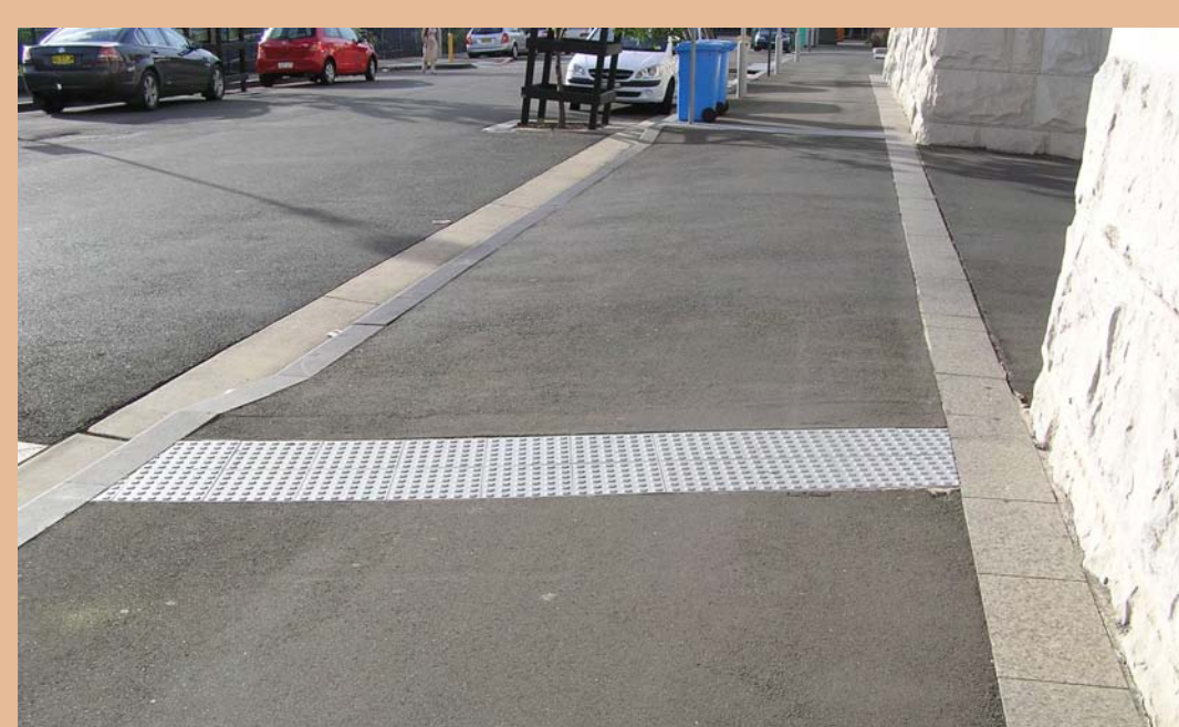
Asphalt with granite banding to building edge + tactiles to driveway