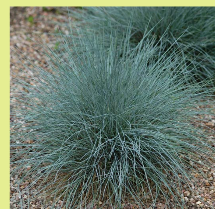
Festuca glauca Blue Fescue