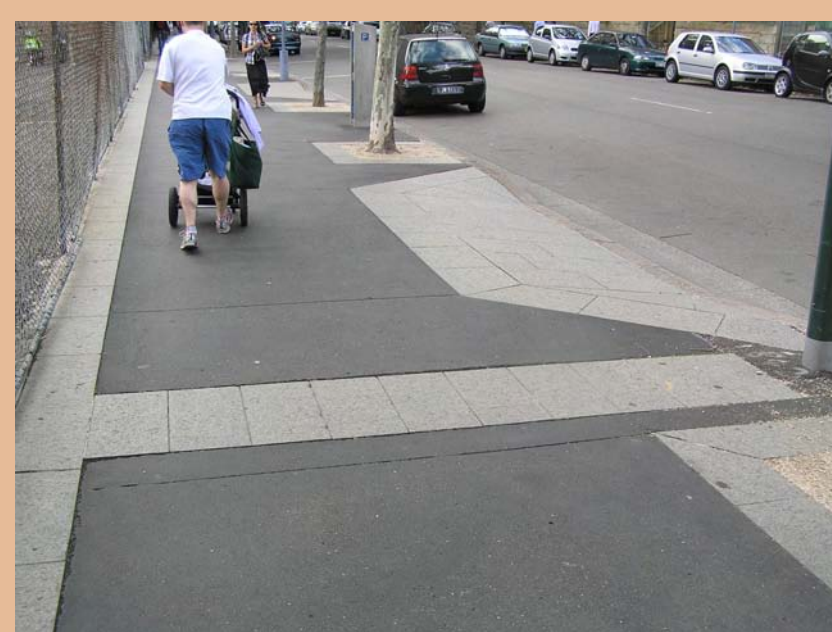
Asphalt with strips of granite paving