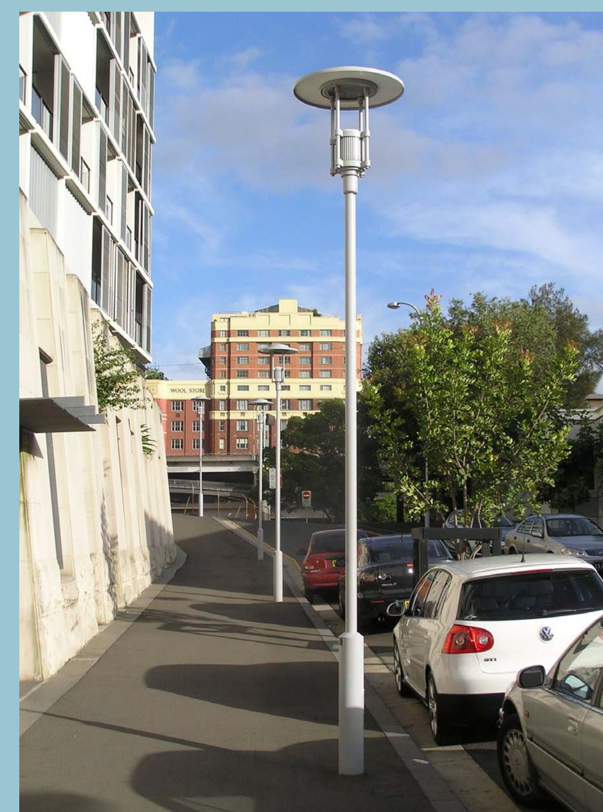
Kim 'Bounce' poletop light