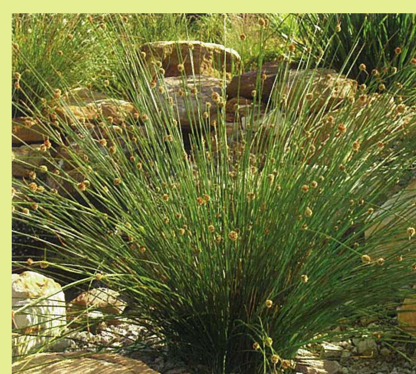
Isolepsis nodosa Knobby Club Rush