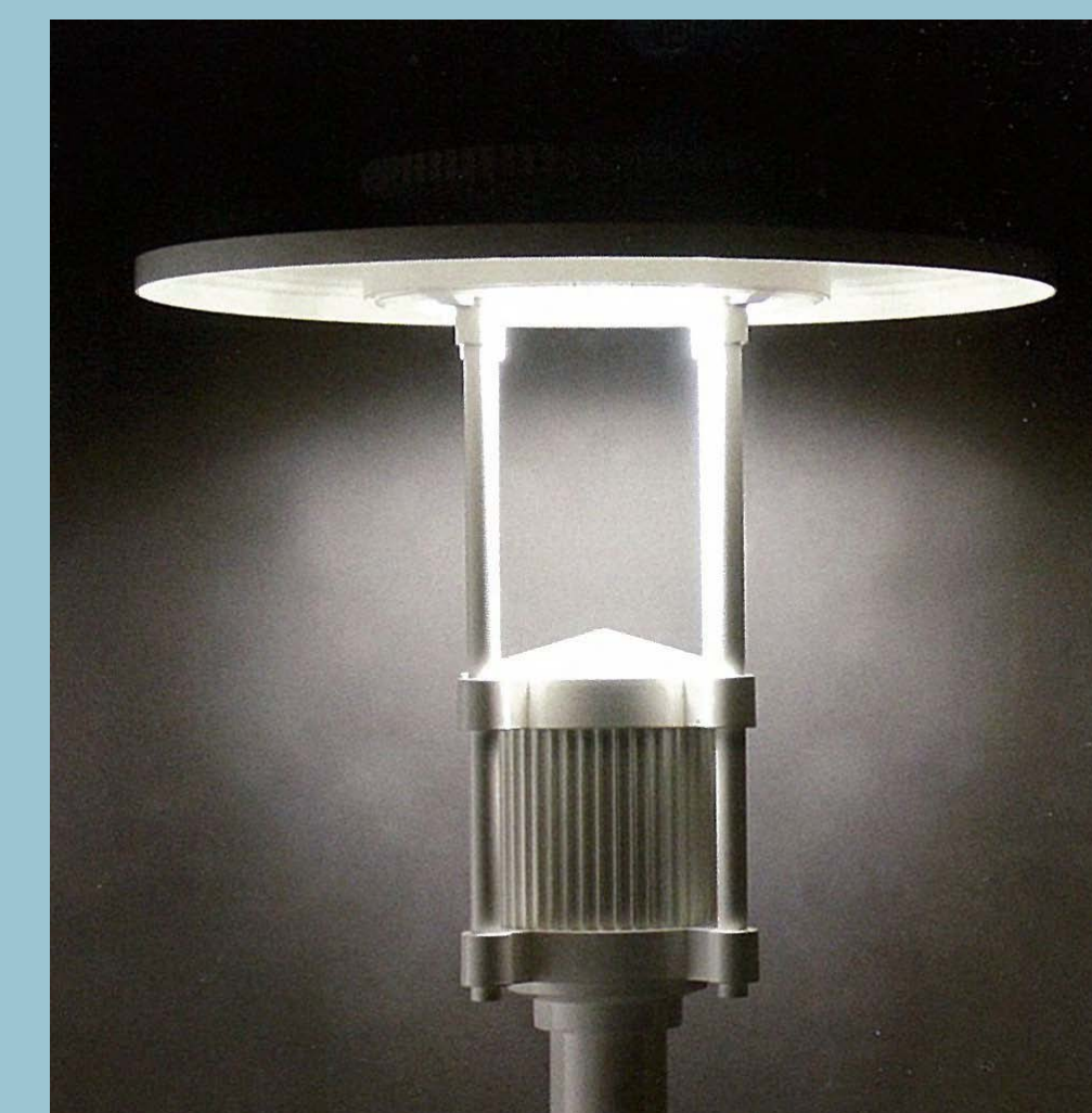
Kim 'Bounce' poletop light