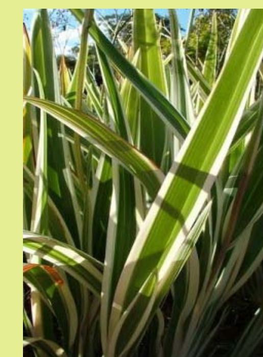
Dianella 'Silver Streak'