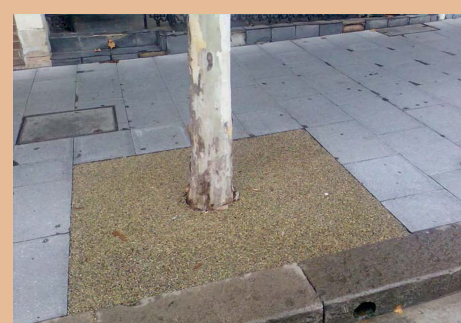
'Terrabond' porous paving to base of trees