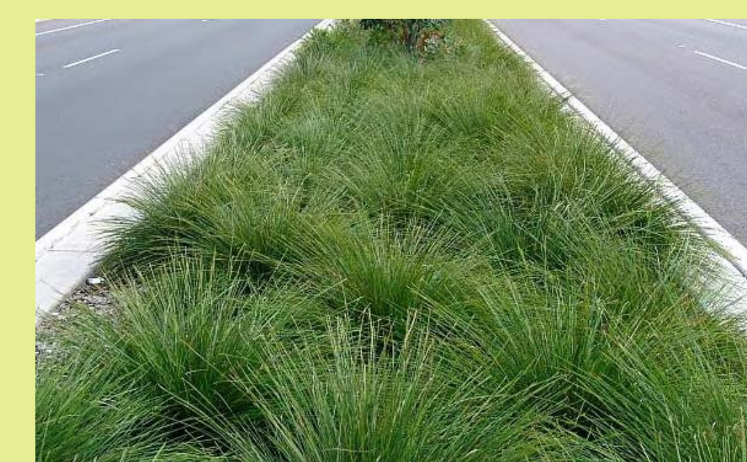
Lomandra longifolia 'Tanika'