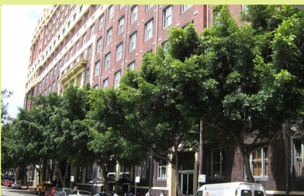
Ficus microcarpa var 'Hillii' Hills Fig