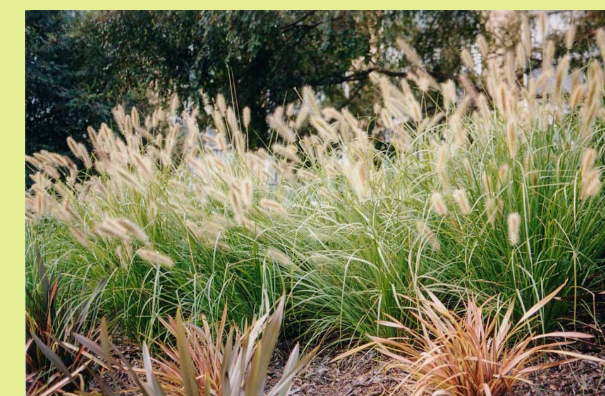
Pennisetum alopecuroides Swamp Foxtail