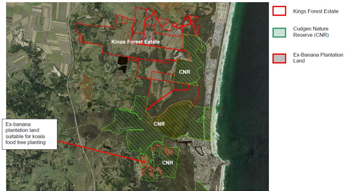
Map 1: Location of ex-Banana Land, nominated by OEH as potential land for Koala food tree planting (condition 45).