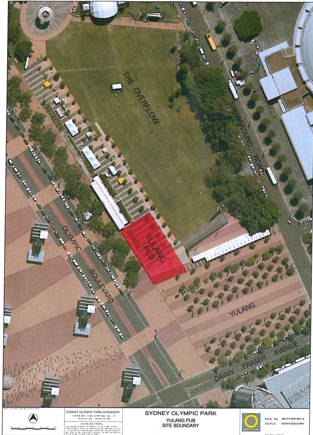
Figure 1 Location Plan