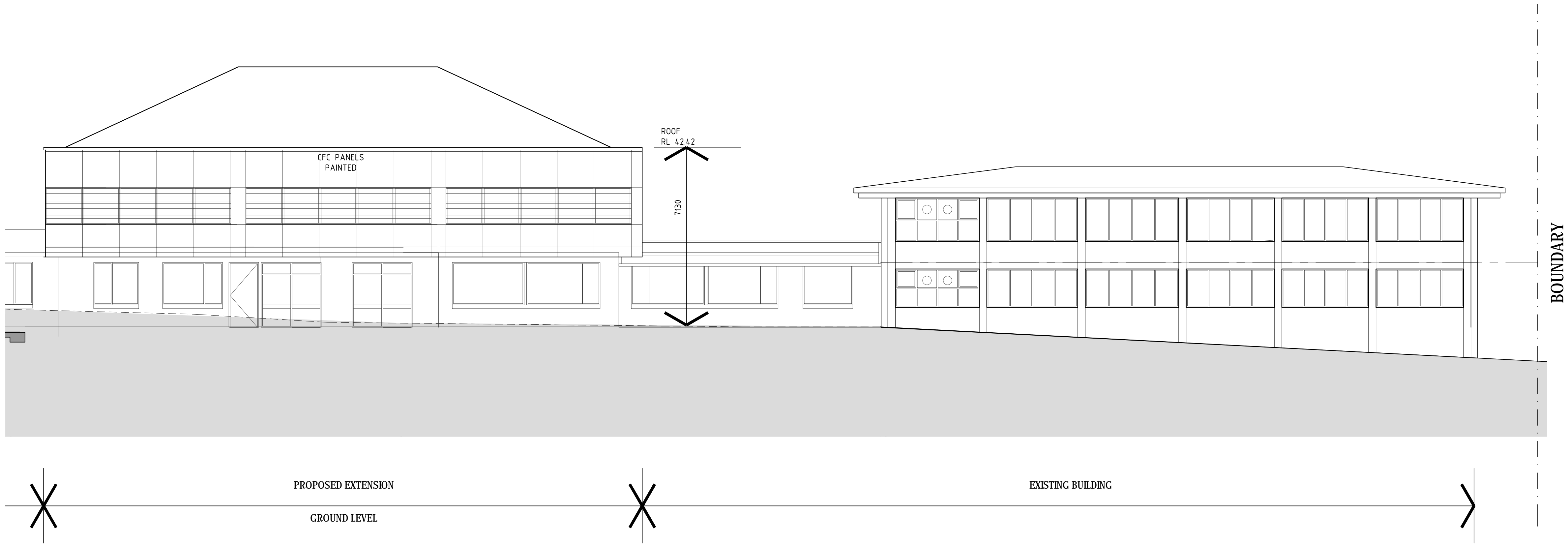
ELEVATION - EAST