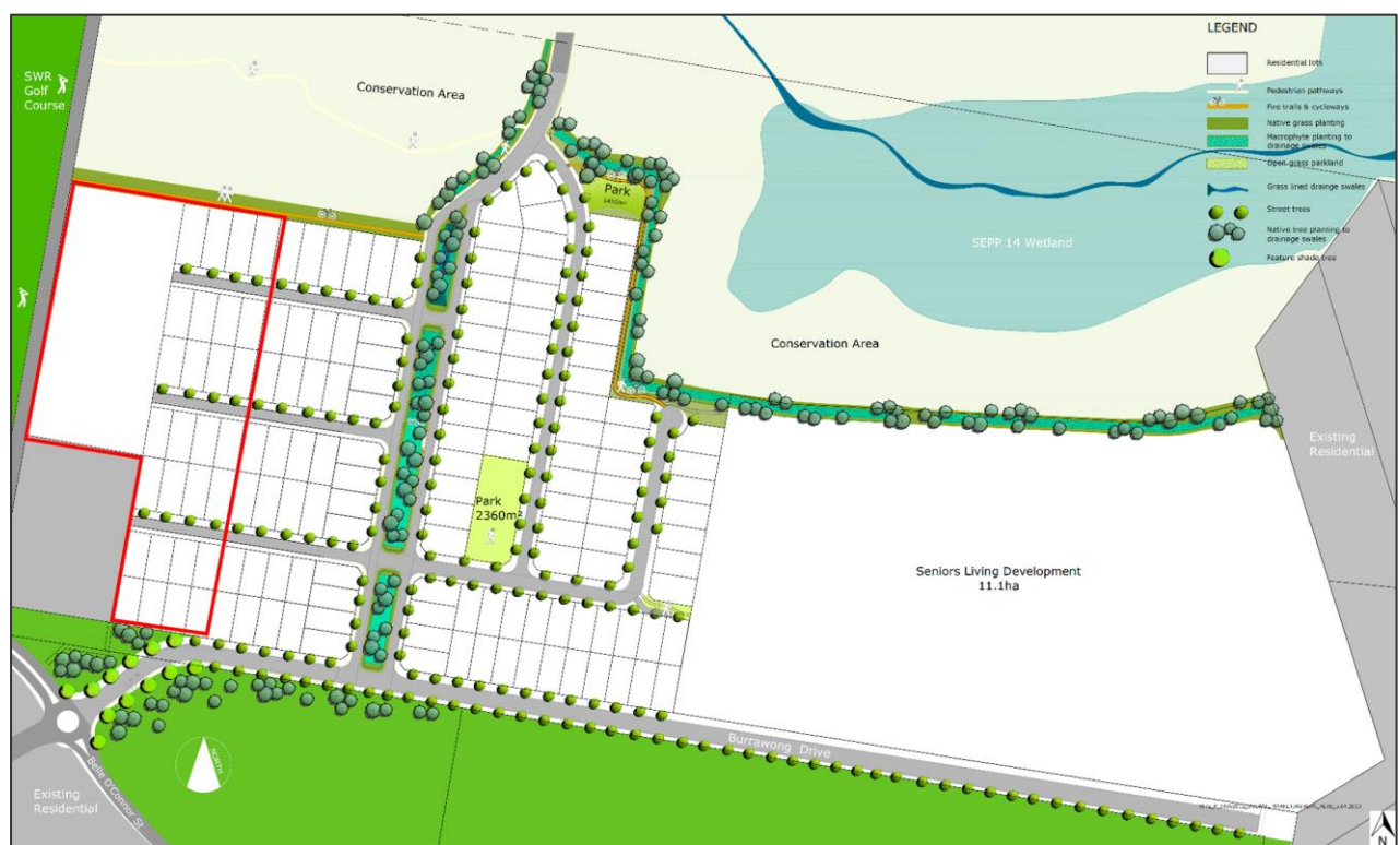
Figure 3: The Project Approval layout (the modification site outlined red) (Base source: MP08_0167 MOD 3)

The approved layout and staging of the Project Approval (as modified) is shown in Figures 3 to 4 .