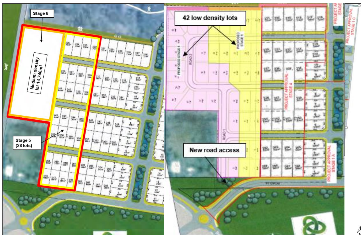
Figure 5: Approved (left) and proposed (right) residential lot layout within stages 5 and 6