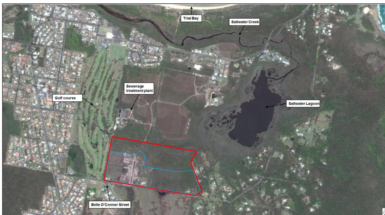
Figure 2: Aerial view of the site location (outlined in red), its surroundings and the subdivision boundary (outlined in blue dashed line)

This modification request relates solely to the western part of the site, known as Stages 5 and 6 (refer to Figures 3 and 4 )