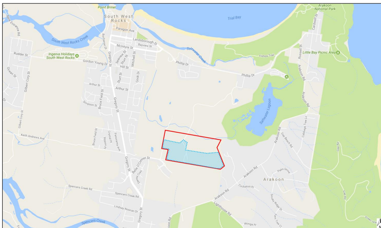
Figure 1: Site location (outlined in red) and subdivision boundary (highlighted blue and outlined in a dashed line)

The subject site covers an area of approximately 28 hectares (ha) and is located at South West Rocks. South West Rocks is located on the New South Wales mid-north coast approximately 28 kilometres (km) to the north-east of Kempsey and 65km to the south of Coffs Harbour (refer to Figure 1 ).