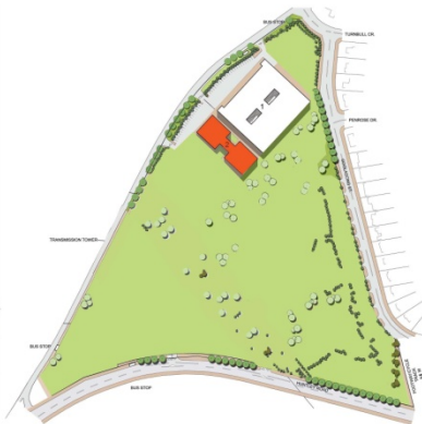
STAGE 2 PATHOLOGY & RADIOLOGY UNITS