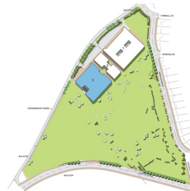
STAGE 3 24 HRS MEDICAL CENTRE, PHARMACY & CASUALTY WITH 10 OVERNIGHT BEDS