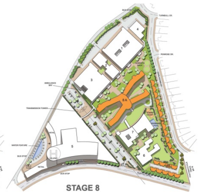
STAGE 8 ILLAWARRA INTERNATIONAL AGED & DISABILITY CENTRE WITH 280 BEDS (MAINLY HIGH CARE) & ACCOMMODATION FOR SENIORS