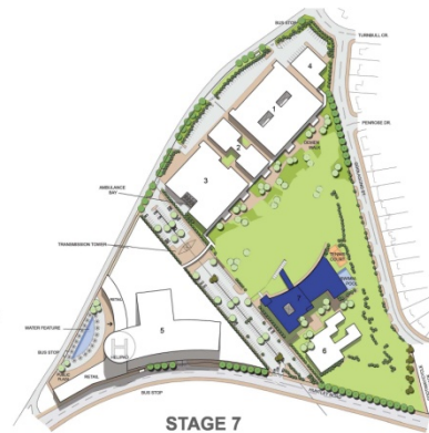
STAGE 7 EDUCATION FACILITY WITH ASSOCIATED ACCOMMODATION FOR PATIENT'S RELATIVES & OUTPATIENT ACCOMMODATION WHILE UNDERGOING EXTENDED THERAPIES