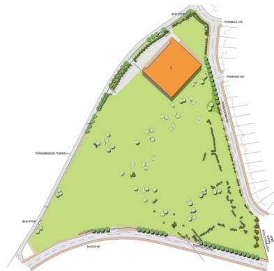
STAGE 1 ILLAWARRA INTERNATIONAL SPECIALIST AND SURGICENTRE INCLUDING 10 OVERNIGHT BEDS 2 ICU BEDS AUGMENTATION OF SERVICES TO SITE