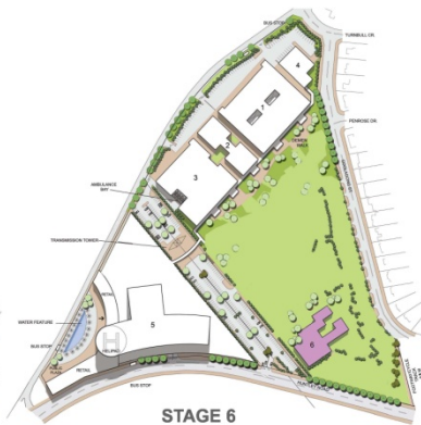
STAGE 6 NURSES, RESIDENT MEDICAL OFFICERS & MEDICAL STUDENT ACCOMMODATION INTEGRAL WITH THE TERTIARY REFERRAL HOSPITAL EDUCATIONAL PROGRAMME