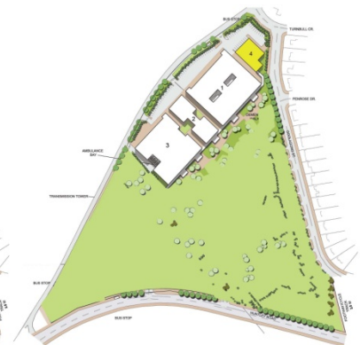
STAGE 4 STAND ALONE OBSTETRIC UNIT WITH 20 OVERNIGHT ONE-BED SUITES