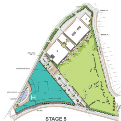
STAGE 5 ILLAWARRA INTERNATIONAL HOSPITAL WITH 240 OVERNIGHT BEDS MIL SHOPPING PLAZA