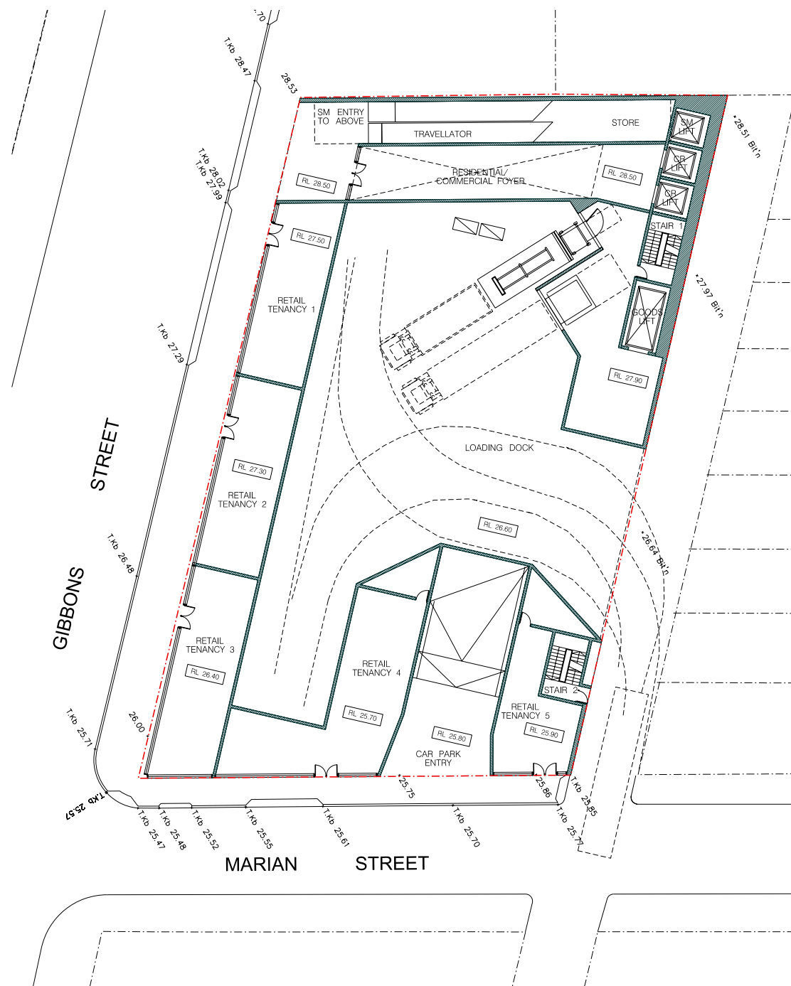
01 GROUND FLOOR PLAN 1:200