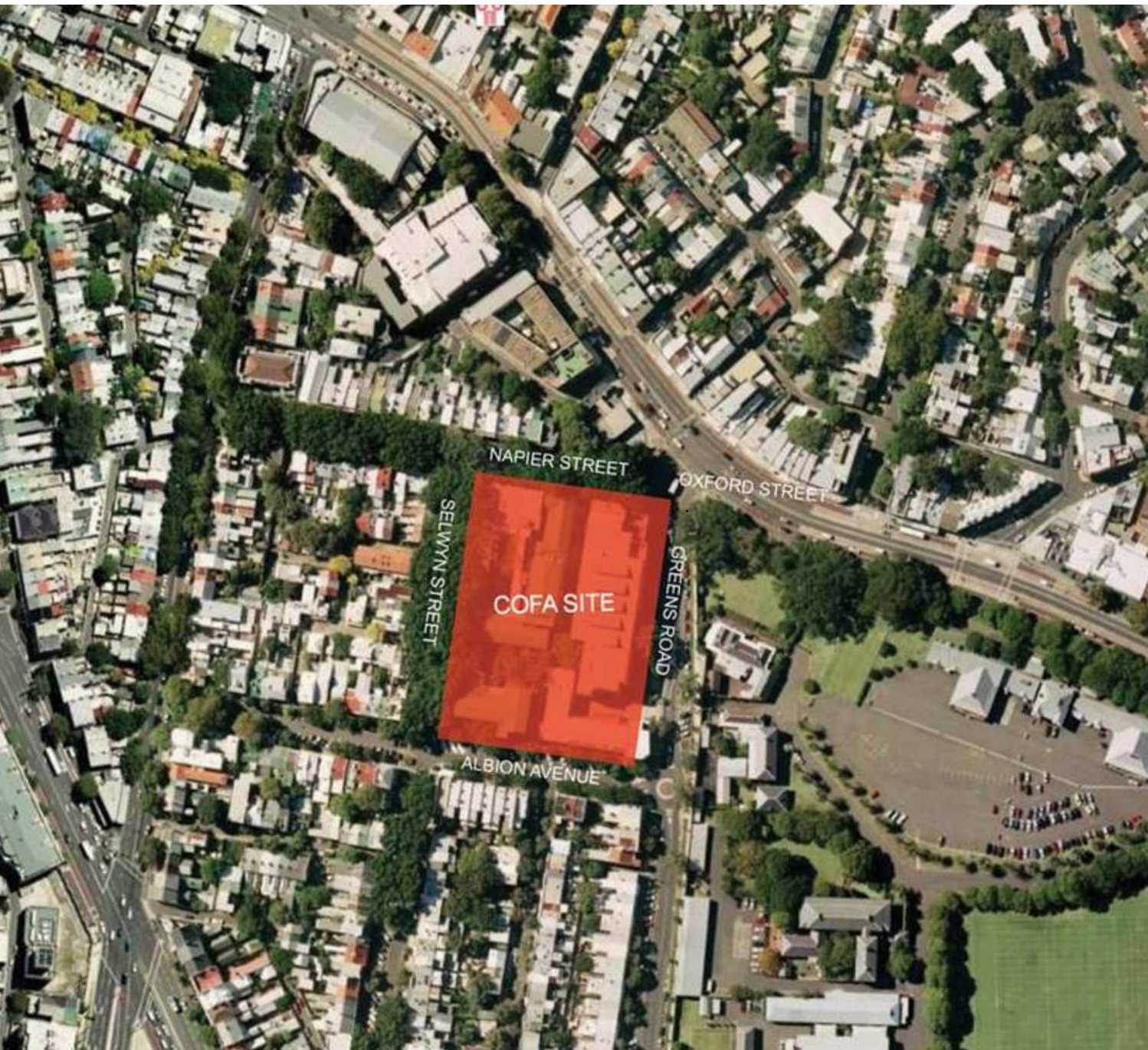
3 LOCATION PLAN Scale: 1 : 2500