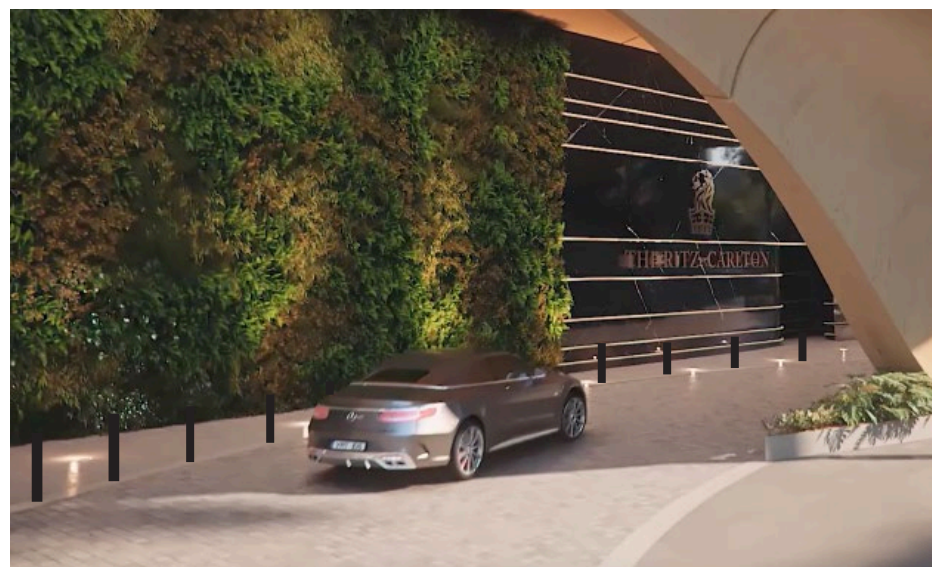
Ritz Carlton Porte Cochere with indicative safety barriers shown