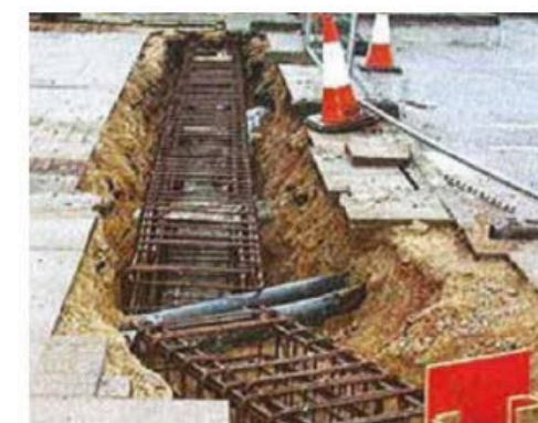
VSB foundations around underground services