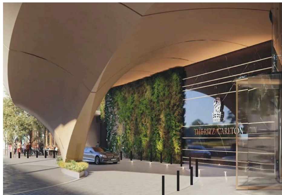
Ritz Carlton Porte Cochere with indicative safety barriers shown