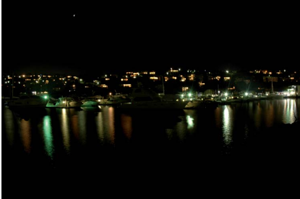
Plate 1: Looking northeast from within the Spit West Reserve, about 300m southwest of the existing marina building. This viewing location is similar to VP 33 of the assessment (Refer Photographic Plate VP 33 (Page 150) in Appendix B)