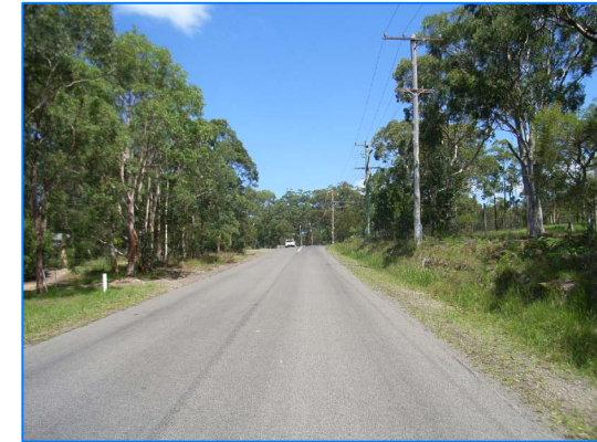
PHOTO 2 - LOOKING TOWARDS MORISSET PARK RD. FROM PROPOSED INTERSECTION