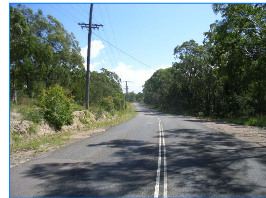
PHOTO 5 - LOOKING WEST ALONG MORISSET PARK RD. FROM PROPOSED INTERSECTION