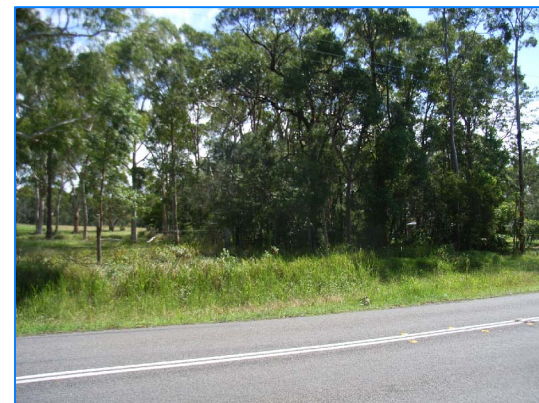
PHOTO 8 - PUBLIC RESERVE 'BUSHLAND'