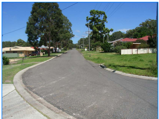
PHOTO 9 - SURROUNDING DEVELOPMENT ALONG CHIFLEY ROAD.