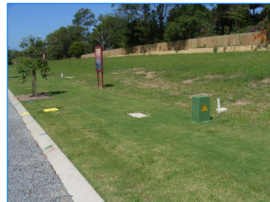
PHOTO 6 - EXAMPLE OF SERVICES WITHIN NATURE STRIP.