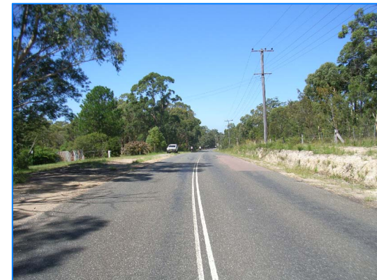
PHOTO 4 - LOOKING TOWARDS CHIFLEY ROAD FROM PROPOSED INTERSECTION