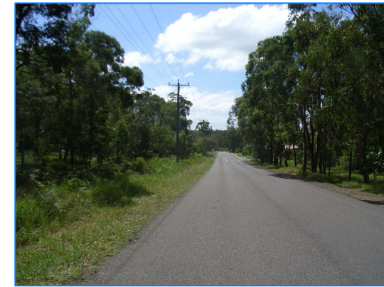
PHOTO 3 - LOOKING TOWARDS MACQUARIE RD. FROM PROPOSED INTERSECTION