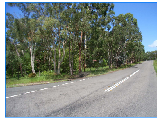
PHOTO 1 - BUSHLAND ALONG CHIFLEY RD.

CONTOUR INTERVAL - 1m (A) EASEMENT TO DRAIN WATER AND SERVICES 3 WIDE (Z910968)