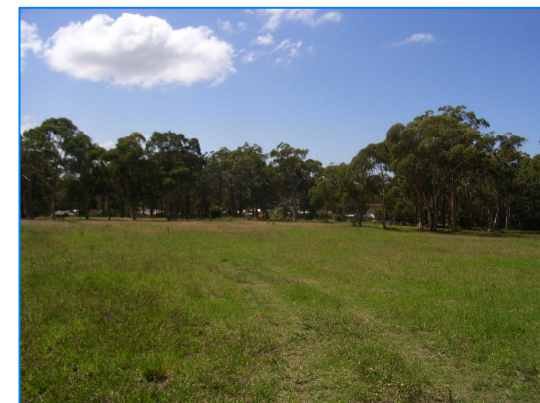
PHOTO 7 - NORTHERLY VIEW FROM WITHIN SITE