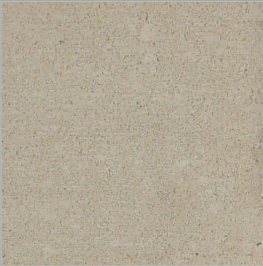
B2 - ALABASTER SMOOTH BAND