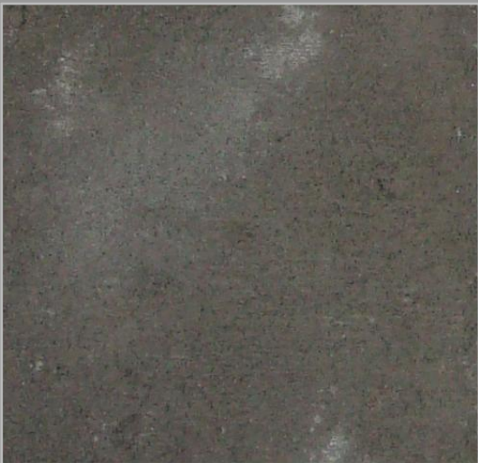
B4 - CHARCOAL SMOOTH BAND