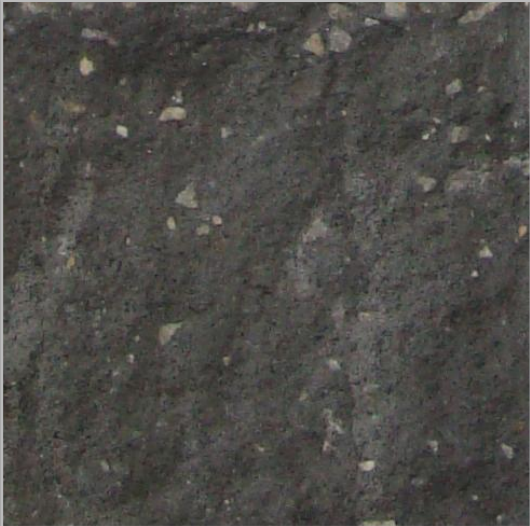
B5 - CHARCOAL SPLIT BLOCK