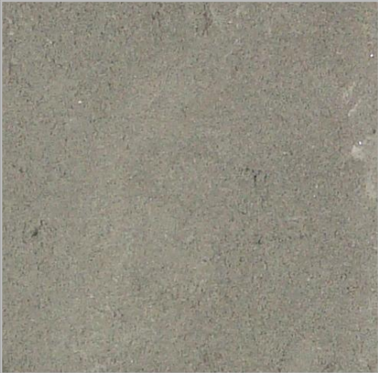
B3 - PEARL GREY SMOOTH BLOCK