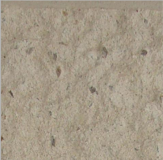
B1 - ALABASTER SPLIT BLOCK