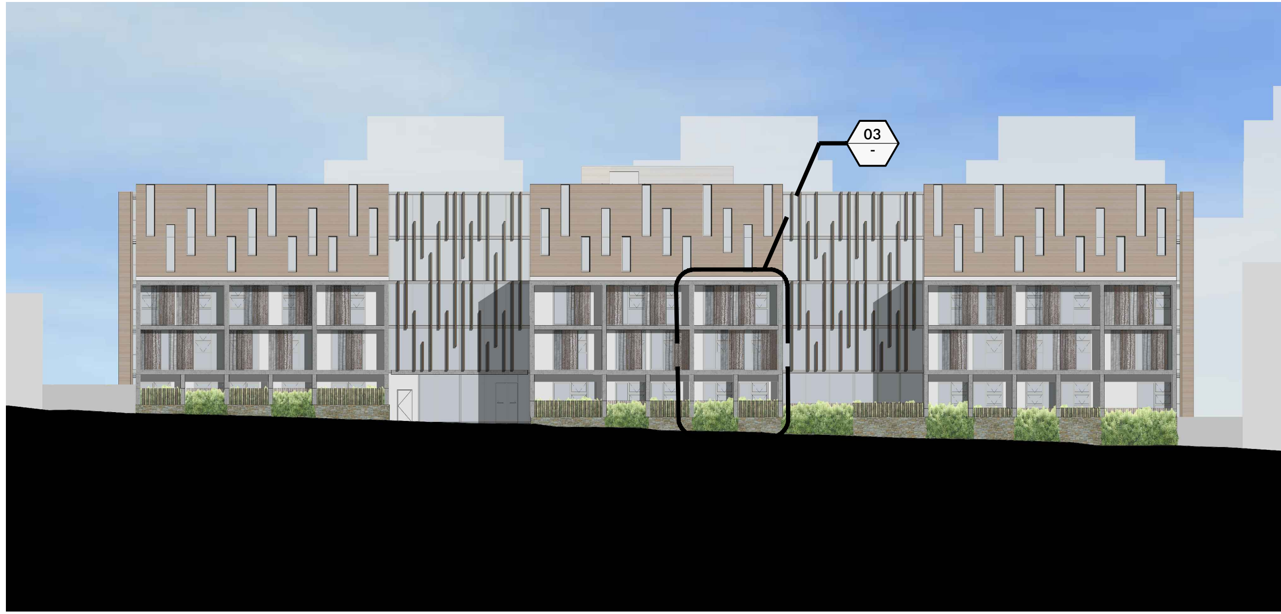
01 SOUTH ELEVATION SCALE 1:250 @ A1