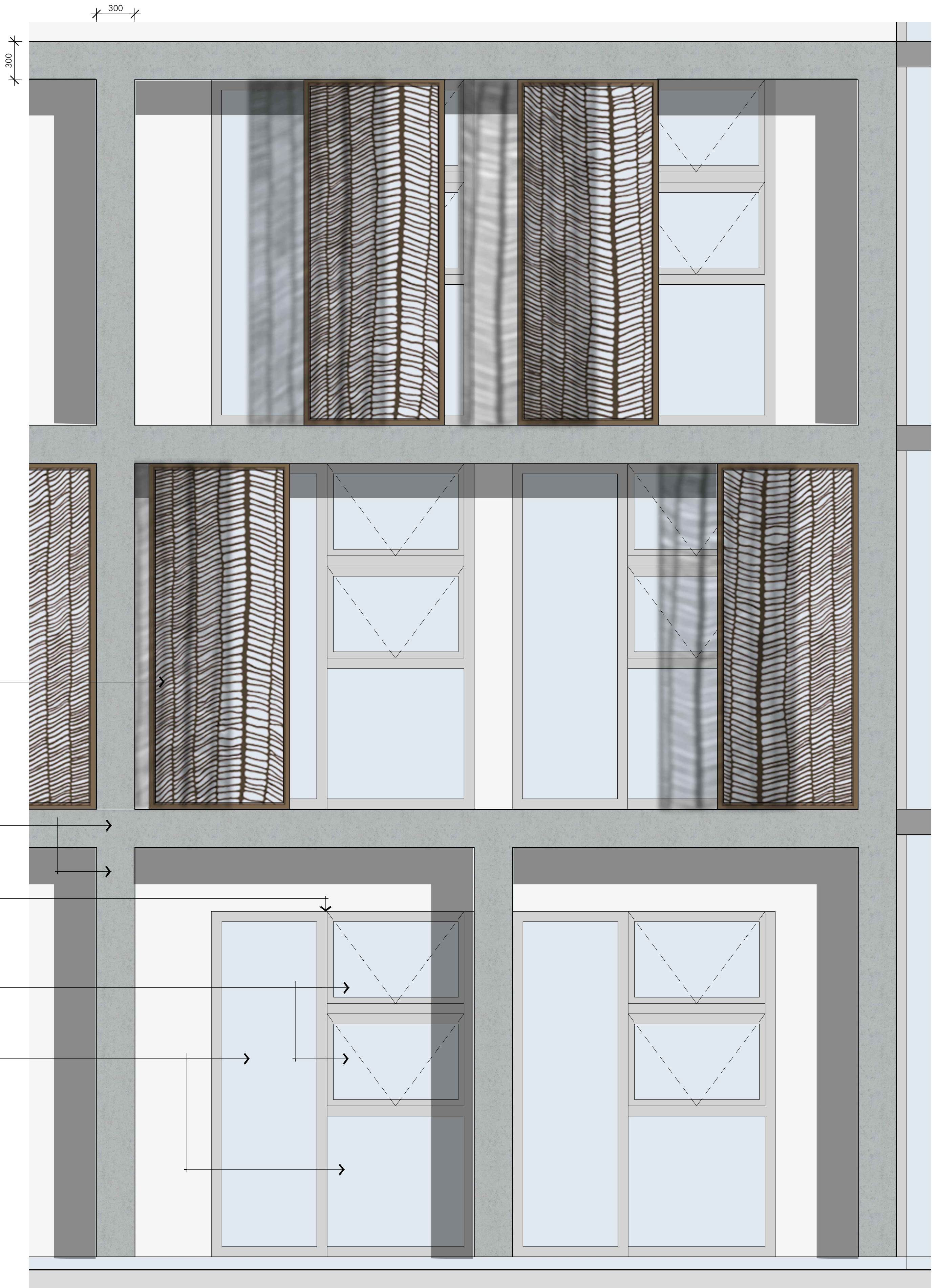
02 INDICITIVE DESIGN INTENT SCALE 1:20 @ A1

Fixed windows with powder coated aluminum frame