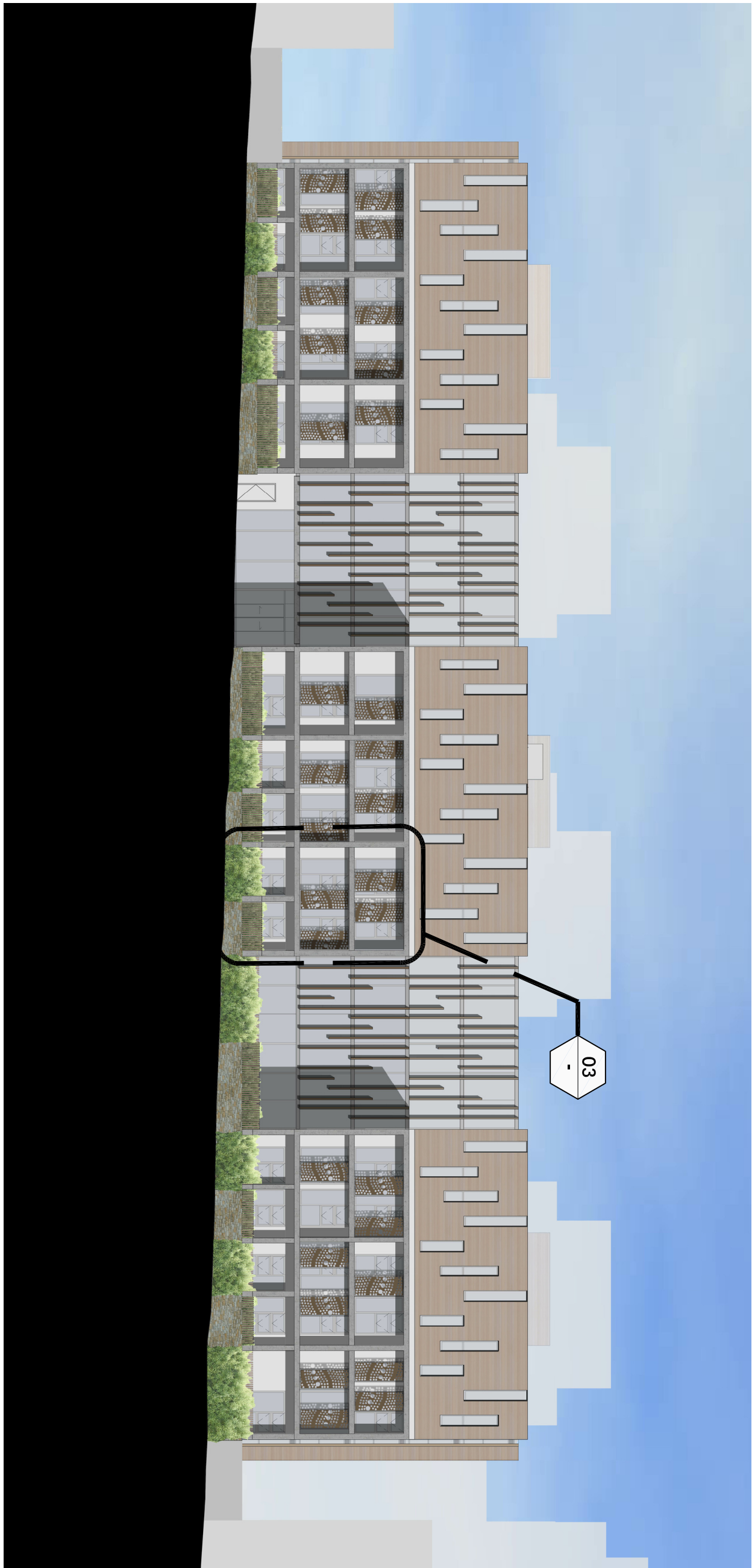
01 SOUTH ELEVATION SCALE 1:250 @ A1