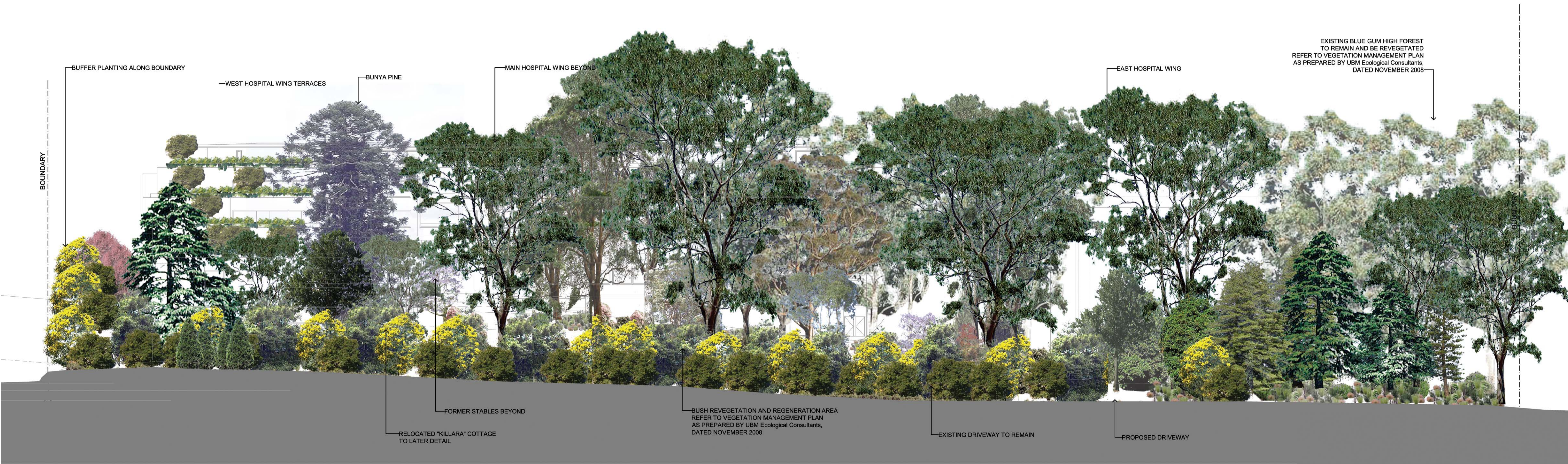
SOUTH BOUNDARY ELEVATION 1:200

taylor brammer landscape architects pty ltd abn 61 098 724 988 Sydney 218 Oxford Street, Woolloomooloo, NSW, Australia, 2025 t: +61 2 9387 8855 f: +61 2 9387 8155 e: sydney@taylorbrammer.com.au South Coast 25 Moore Street, PO Box 64, Austinmer, NSW, 2515 t: +61 4267 5088 f: +61 2 4267 4826 e: southcoast@taylorbrammer.com.au Copyright of Taylor Brammer Landscape Architects Pty Ltd. Figure dimensions shall be taken in preference to scaling. The contractor shall check all dimensions on site before commencing work.