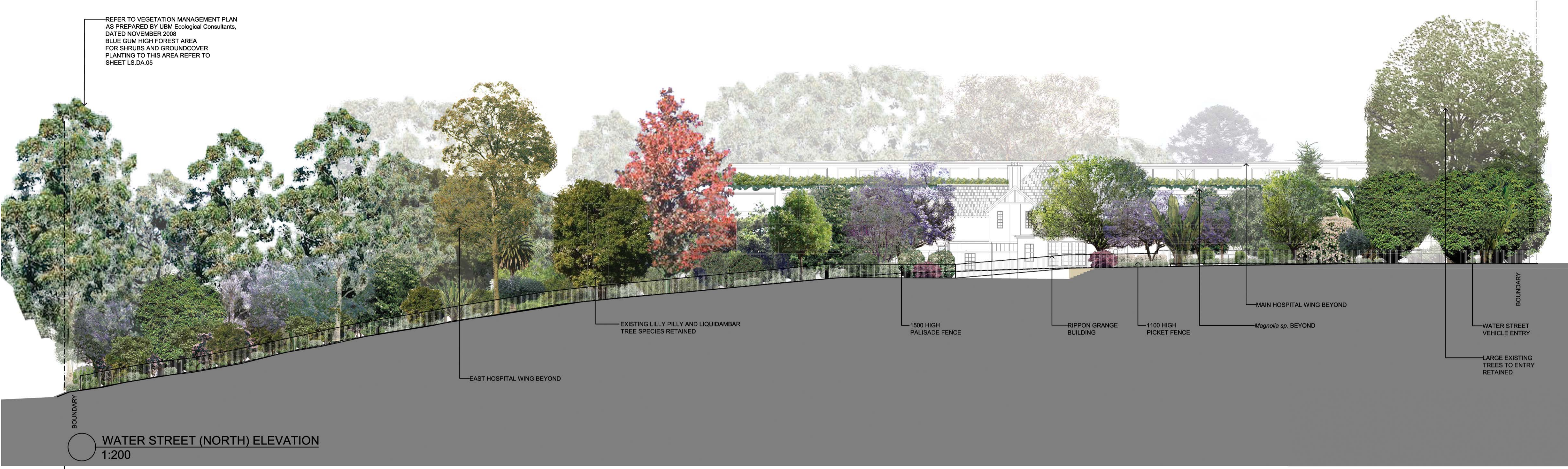
WATER STREET (NORTH) ELEVATION 1:200