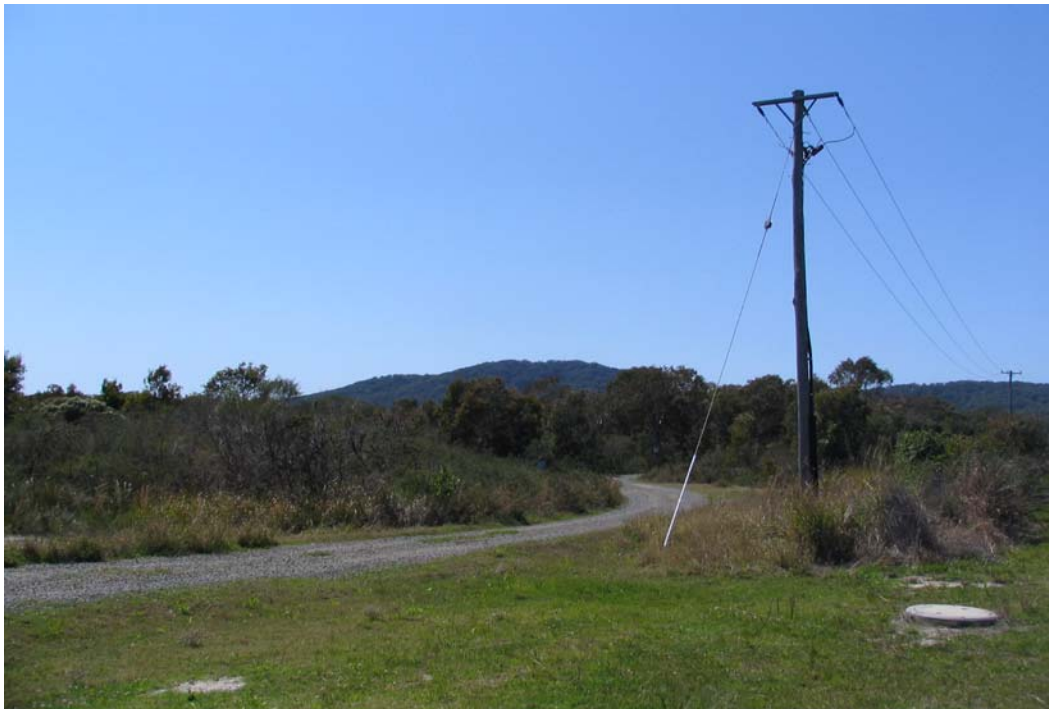
Photograph No. 10 – Looking northeast from the Integrated Development Site [Lot 700], across the adjoining land showing Coastal Heath vegetation.