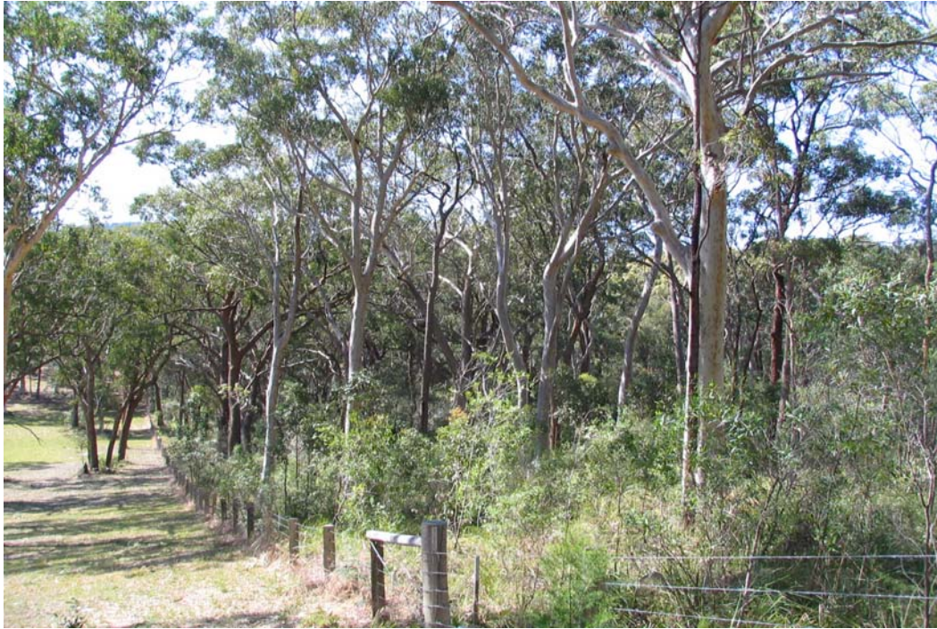
Photograph No. 9 – Looking east from Lot 622, along the southern boundary, showing Forest vegetation on the adjoining rural residential land to the south.