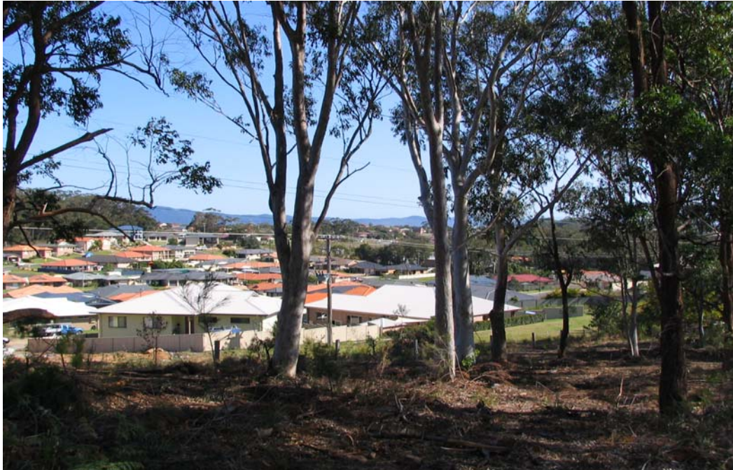
Photograph No. 1 – Looking northwest from western boundary of Estate to adjoining residential development.