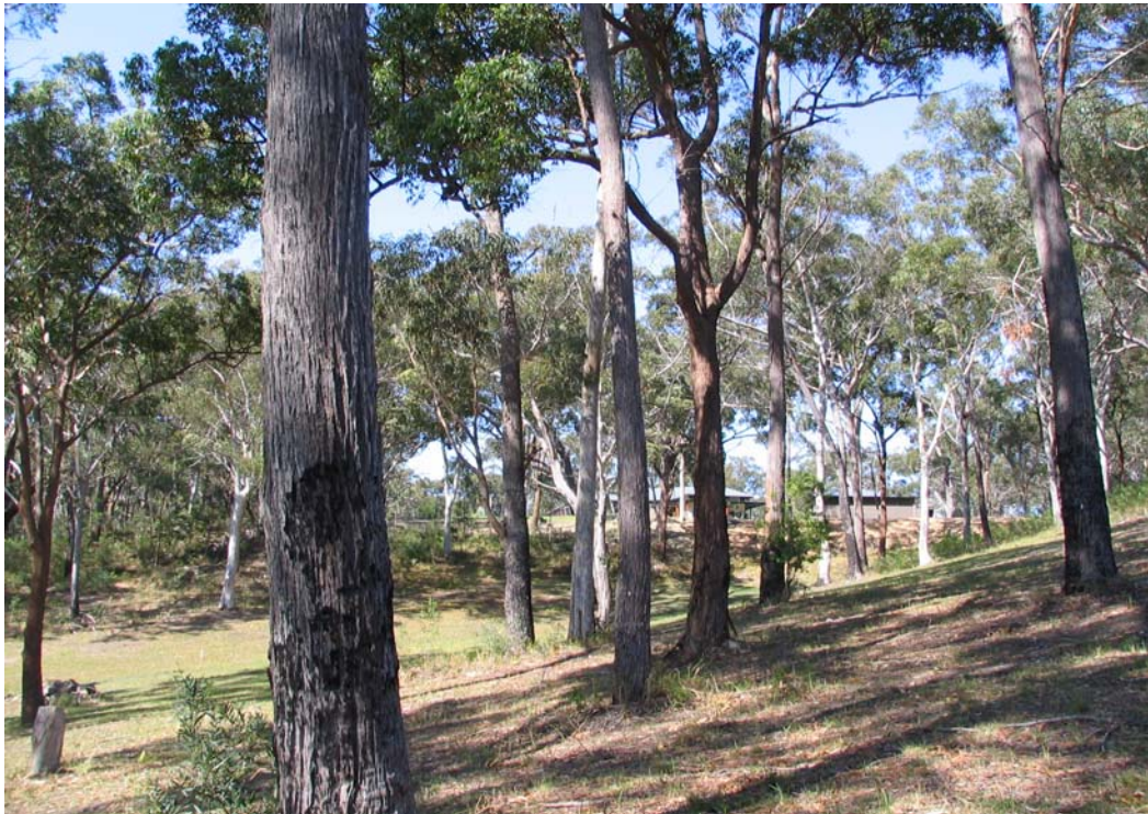
Photograph No. 6 – Looking south along the rear boundary of Lots 614 – 617 showing extent of Asset Protection Zone to these lots, including to the southwest of Lots 617 & 618. Dwelling on the adjoining property is shown in the background.