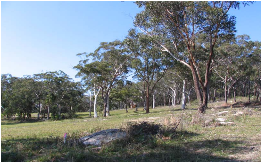
Photograph No. 2 – Looking along the rear of Lots 605 – 613 showing the managed grassland within 7(d) land on Residue Lot 800 [Asset Protection Zone] & Forest vegetation on the higher ridgeline in the south-western corner of the Estate.