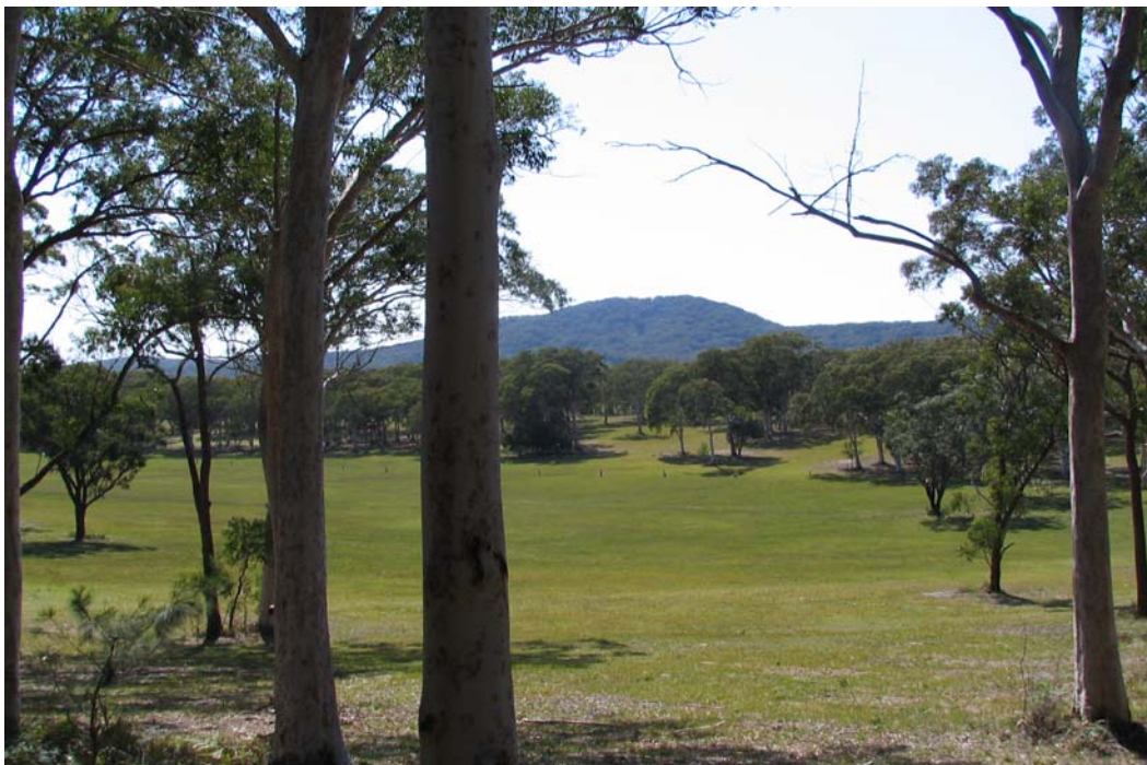
Photograph No. 8 – Looking northeast from Lot 622, across the approved Estate lands to the managed lands on the adjoining property.