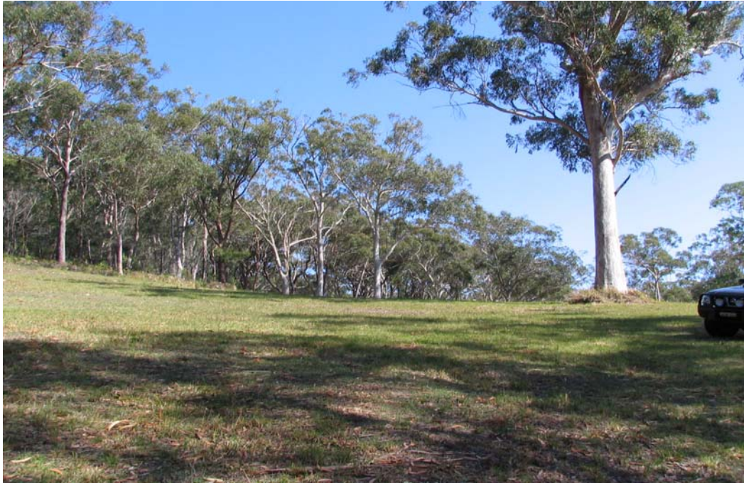
Photograph No 5 – Looking west from Lot 615, showing extent of managed Asset Protection Zone to the rear of the lots.