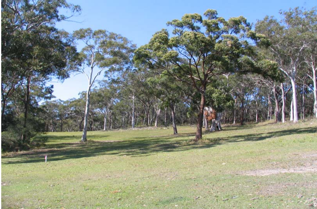
Photograph No. 3 – Looking along the rear of Lot 613 showing managed grassland within 7(d) zoned land on Residue Lot 800 [APZ] and Forest vegetation on the ridgeline.