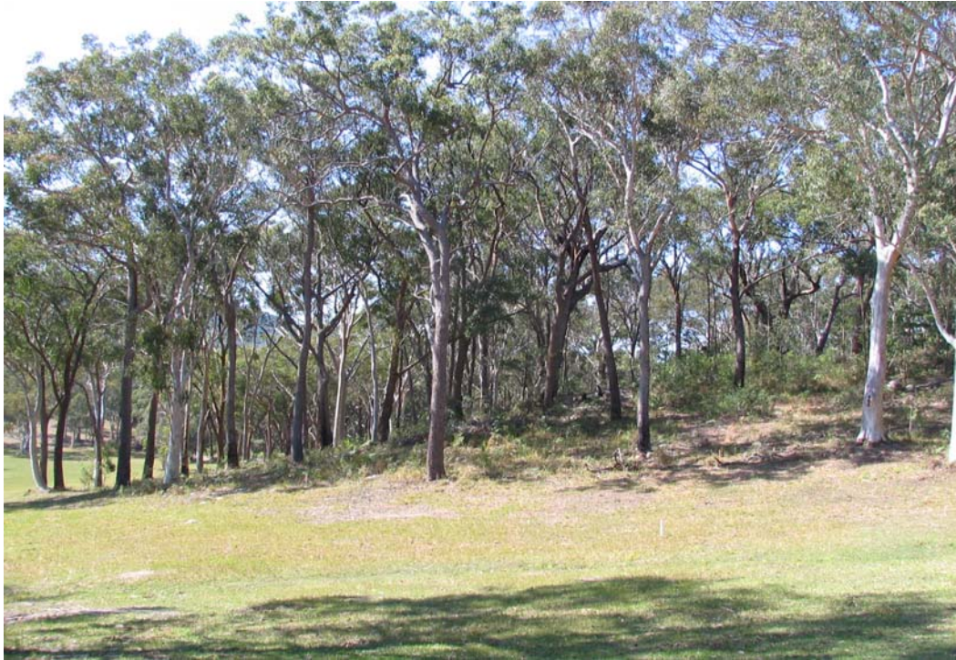
Photograph No. 7 – Looking southeast across spur to the south of Lots 618 – 622 showing Forest vegetation that will be retained in the 7(d) zoned land [Lot 800]. Proposed lots will be located to the left of the vegetation, within the cleared portion of the Estate.