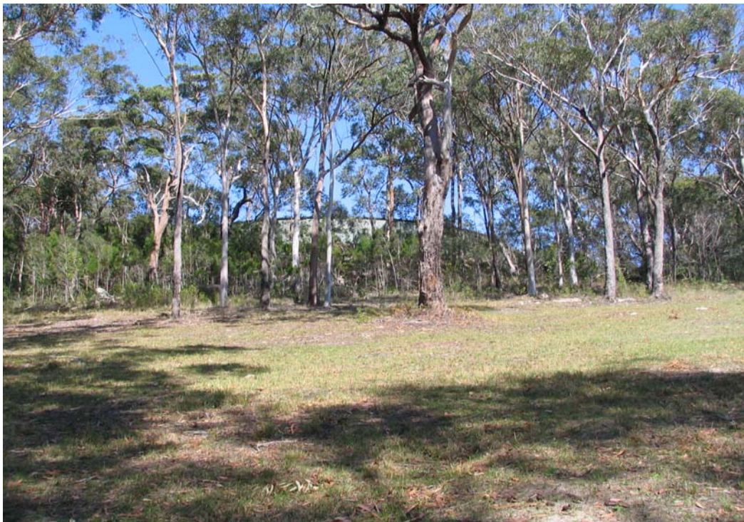
Photograph No. 4 – Looking southwest from the rear of Lots 614 – 616 to Forest vegetation and Water Reservoir.